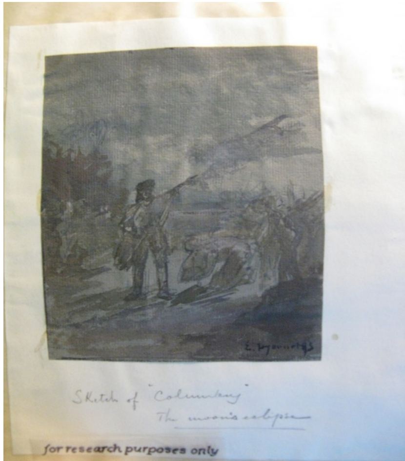
Figure 4: Edmond Dyonnet's watercolour "Columbus."

In Edmond Dyonnet's watercolour, submitted at the same meeting, we can discern the appropriation of Columbus as a heroic figure for Canadian history (fig. 4). Columbus allegedly used an almanac to predict a lunar eclipse, thereby saving his soldiers from the ire of the Indigenous population in Jamaica, but Dyonnet's painting undeniably associates Columbus with Canada by portraying him as a "coureur des bois" rather than an explorer.