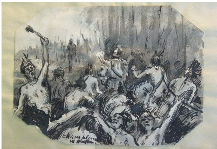
Figure 2: William Hope’s sketch “Champlain.”

the conquered savage” but also, and perhaps most importantly, because “the old hero told us his marvellous story of adventure and conflict in true soldierly fashion.” It is significant that in the same sentence, Rielle appropriates Champlain as a “Canadian” figure, uses a military vocabulary, and makes a reference to storytelling. Rielle’s treatment of Champlain exemplifies the Club’s conviction that literary and artistic treatments of heroic figures help develop the historical narrative necessary to foster a sense of nationalism. Such a treatment is provided by William Hope, another Pen and Pencil member, who submitted a sketch of Champlain as a contribution to the Club’s scrapbook (fig. 2). Hope, who would eventually become Canada’s official war artist during the First World War, depicts Champlain first and foremost as a warrior and a leader of the Hurons. He is calm and imperial in contrast to the Huron frenzy, shunning guerrilla warfare in favour of a more traditional, even gentlemanly “parley.” Champlain walks towards what is presumably an Iroquois chief, holding what is either a gun or a torch, both of which hold highly symbolic value in portraying Champlain as an imperial emissary. Hope has sketched him walking away from the viewer, suggesting that Champlain’s progress is also an expansion of the Empire.