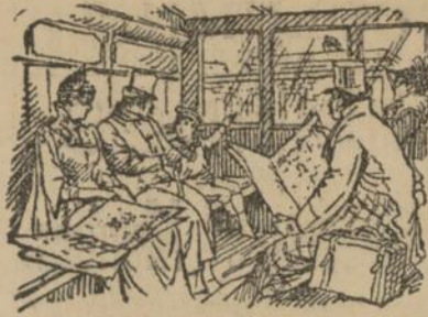
THEY ALL READ THE HERALD.