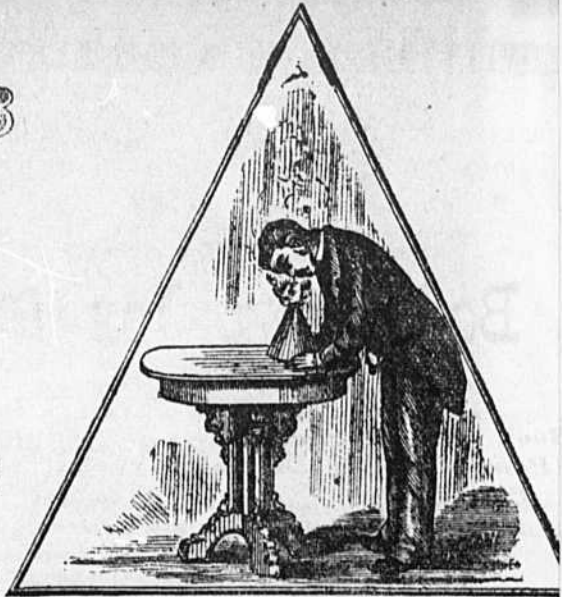
The above Cut shows the method of using this Remedy.

Mailed to any Address on receipt of $1.10 per large box, small do, 55 cts.