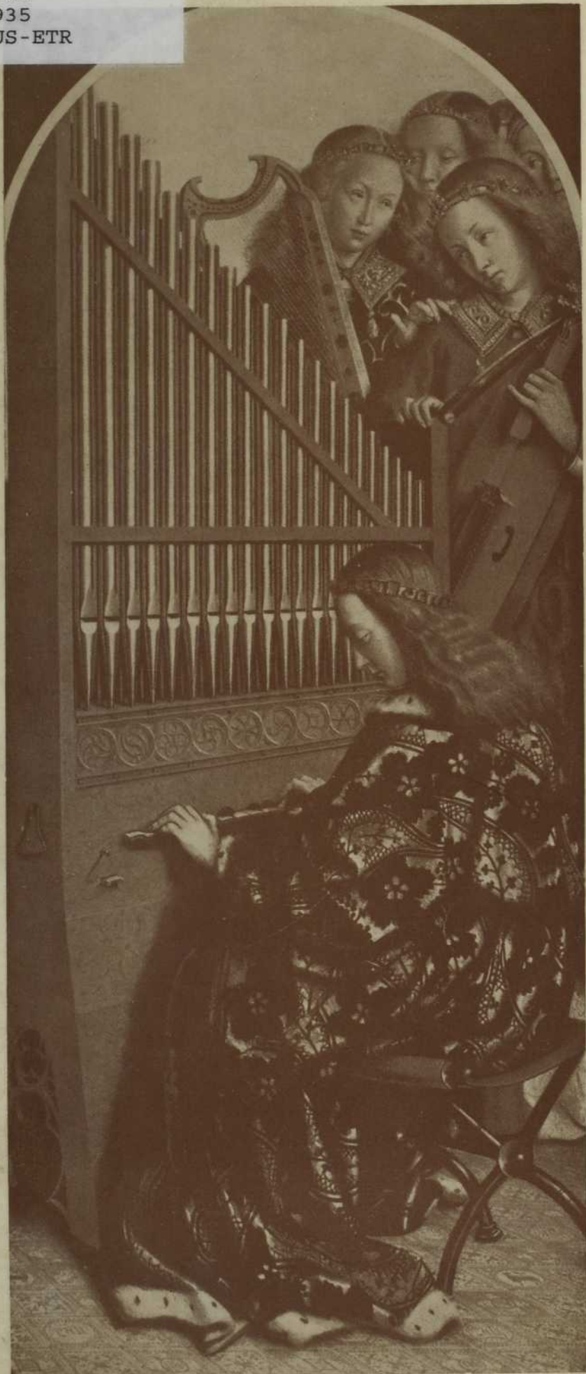
Van Eyck: Flügel des Genter Altarbildes