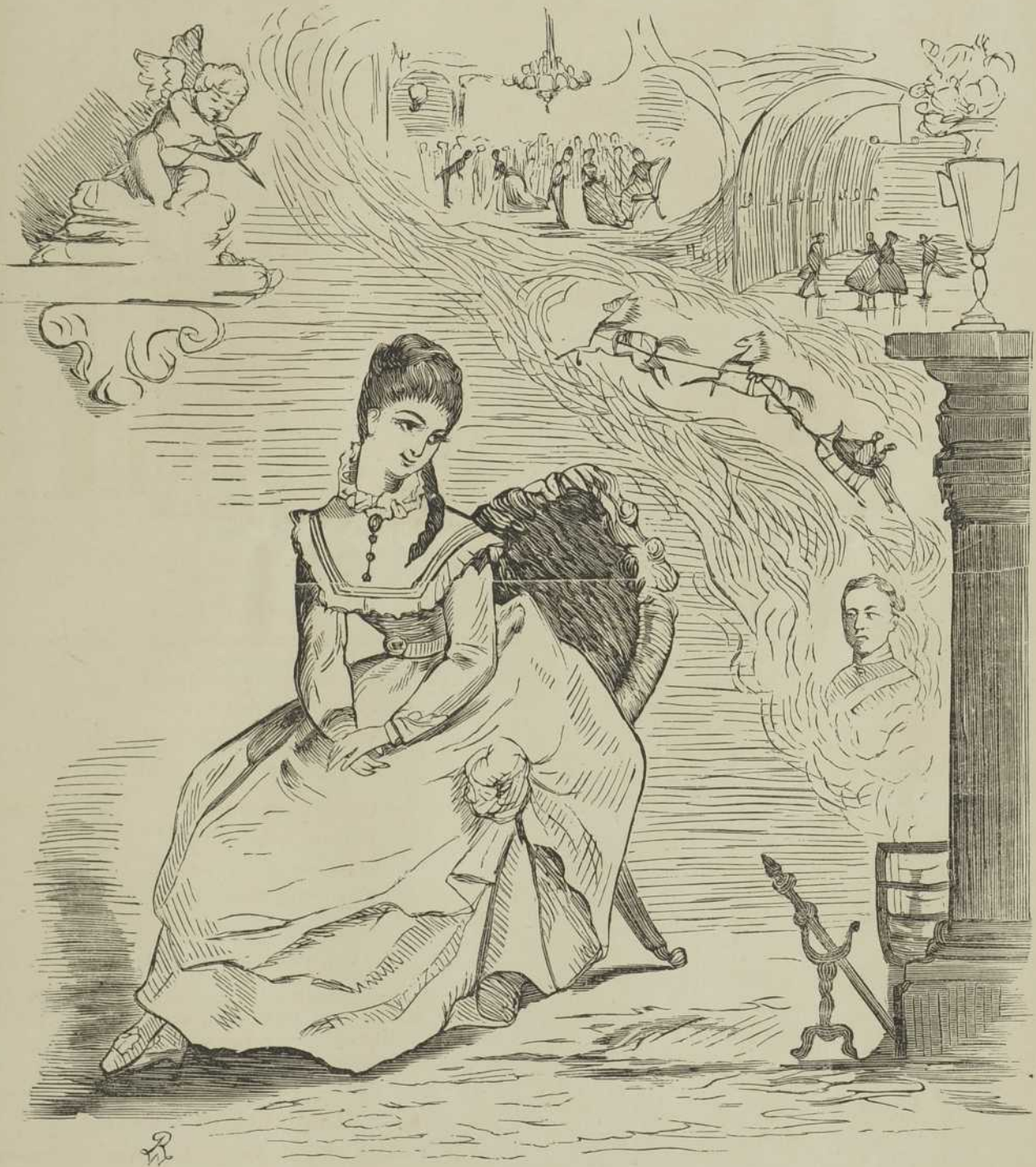
THE WAKING DREAMS OF BEAUTY.