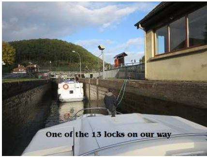
One of the 13 locks on our way