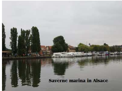
Saverne marina in Alsace