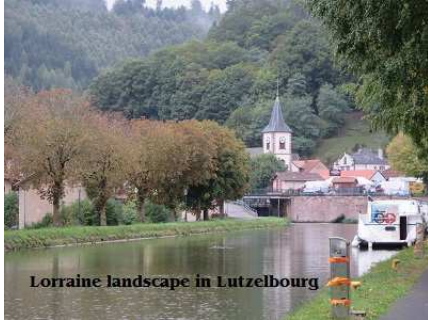
Lorraine landscape in Lutzelbourg