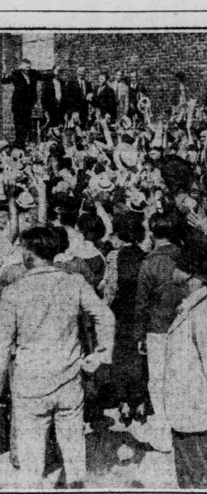
Scenes like this were being enacted throughout the South as labor leaders sought to rally their forces to make the United States Textile Workers' strike one hundred per cent effective. A group of union executives at Charlotte, N.C., is shown haranguing a crowd which has just raised its hands to signify its willingness for a finish fight against mill operators.