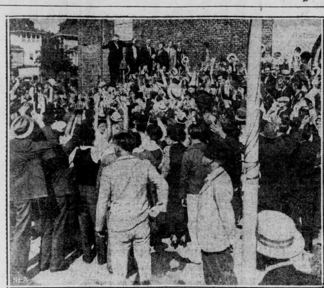
Scenes like this were being enacted throughout the South as labor leaders sought to rally their forces to make the United States Textile Workers' strike one hundred per cent effective. A group of union executives at Charlotte, N.C., is shown haranguing a crowd which has just raised its hands to signify its willingness for a finish fight against mill operators.