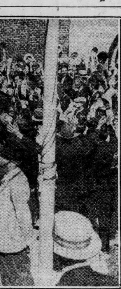
Scenes like this were being enacted throughout the South as labor leaders sought to rally their forces to make the United States Textile Workers' strike one hundred per cent effective. A group of union executives at Charlotte, N.C., is shown haranguing a crowd which has just raised its hands to signify its willingness for a finish fight against mill operators.