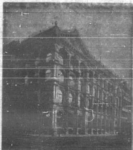
Montreal Building—Victoria Square