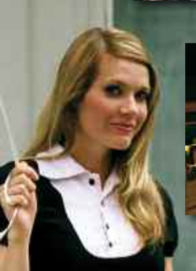
Psukhô in concert