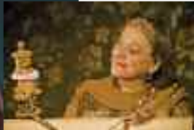
Les habits neufs