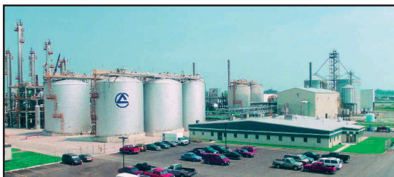
Commercial Alcohols Inc. ethanol plant in Chatham, Ontario

Through the partnership, Québec will be involved in research and development projects and will consider the possibility of creating joint ventures for the import and export of ethanol. It will also take part in public awareness-raising activities on the benefits of ethanol, and will work on the creation of an international economic climate for the increased use of fuel ethanol.