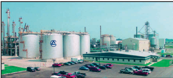
Commercial Alcohols Inc. ethanol plant in Chatham, Ontario

Through the partnership, Québec will be involved in research and development projects and will consider the possibility of creating joint ventures for the import and export of ethanol. It will also take part in public awareness-raising activities on the benefits of ethanol, and will work on the creation of an international economic climate for the increased use of fuel ethanol.