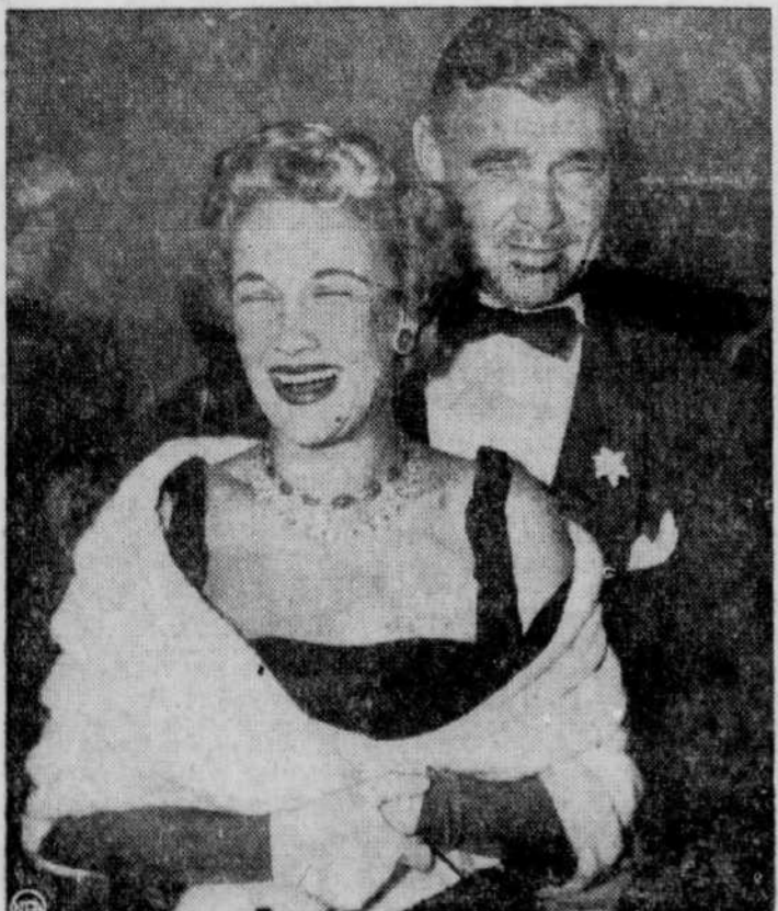
Newlyweds — Actor Clark Gable and Kay Williams Spreckels, seen in the glaring lights of a Hollywood premiere several months ago, were married recently at Minden, Nev. It is Gable's fifth, her third.

Hundreds of Roman Catholics, following advice from the archbishop's palace to pray for rain, held a pilgrimage Tuesday night to the shrine of Notre Dame de Roc Amadour.