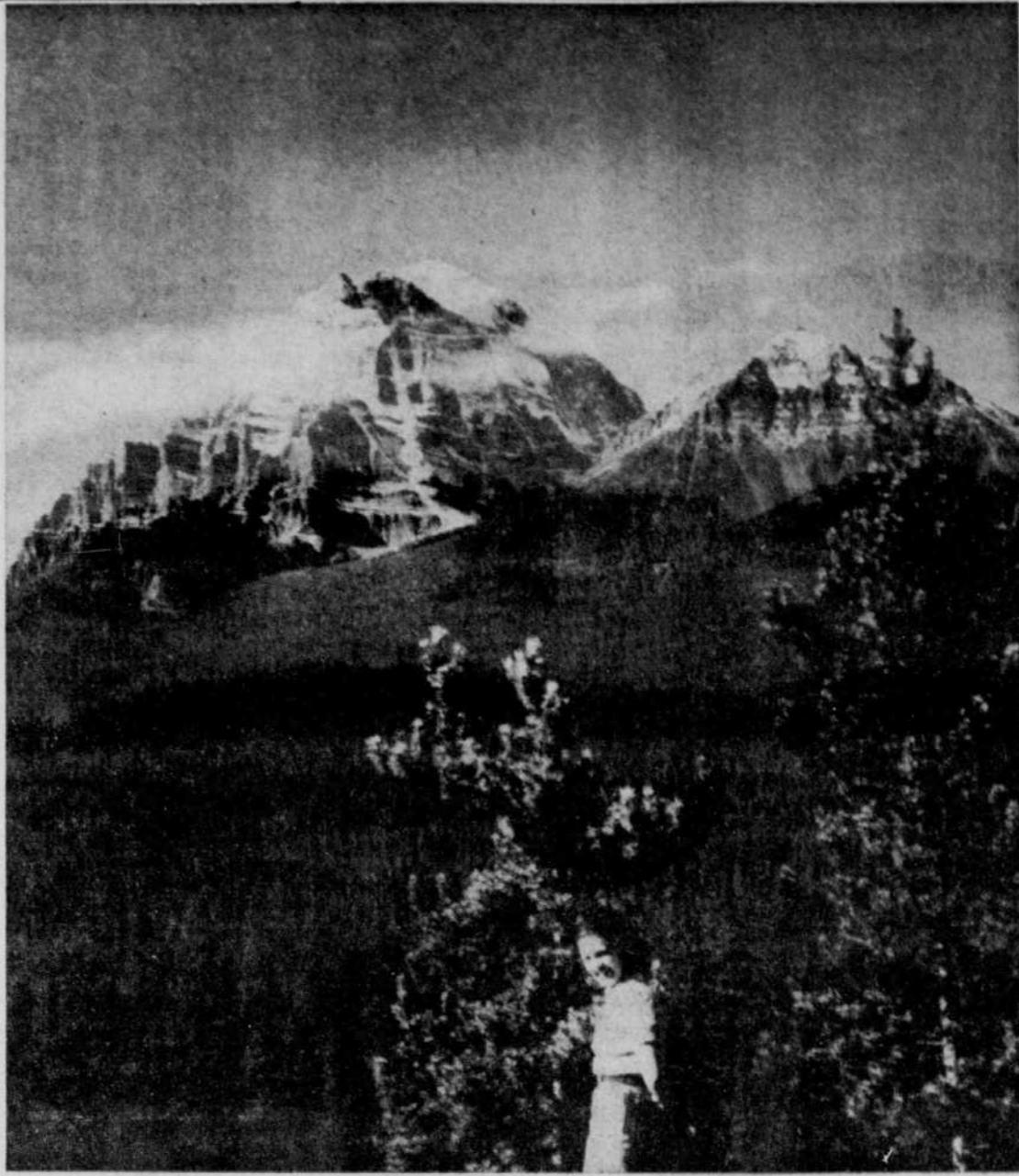
Where Seven Died — In the distance is towering Mount Temple in Banff National Park, scene of a snow avalanche in which seven American boys died. Two others were taken to hospital suffering from injuries, shock and exposure, while another two escaped injury. The boys, members of the Wilderness Club of Philadelphia, were part of a group of about 30 which had been in the area three days.

Wife, to husband who had had a few drinks too many: "If it were the first time, Max, I could forgive you. But you came home like this in November, 1916."