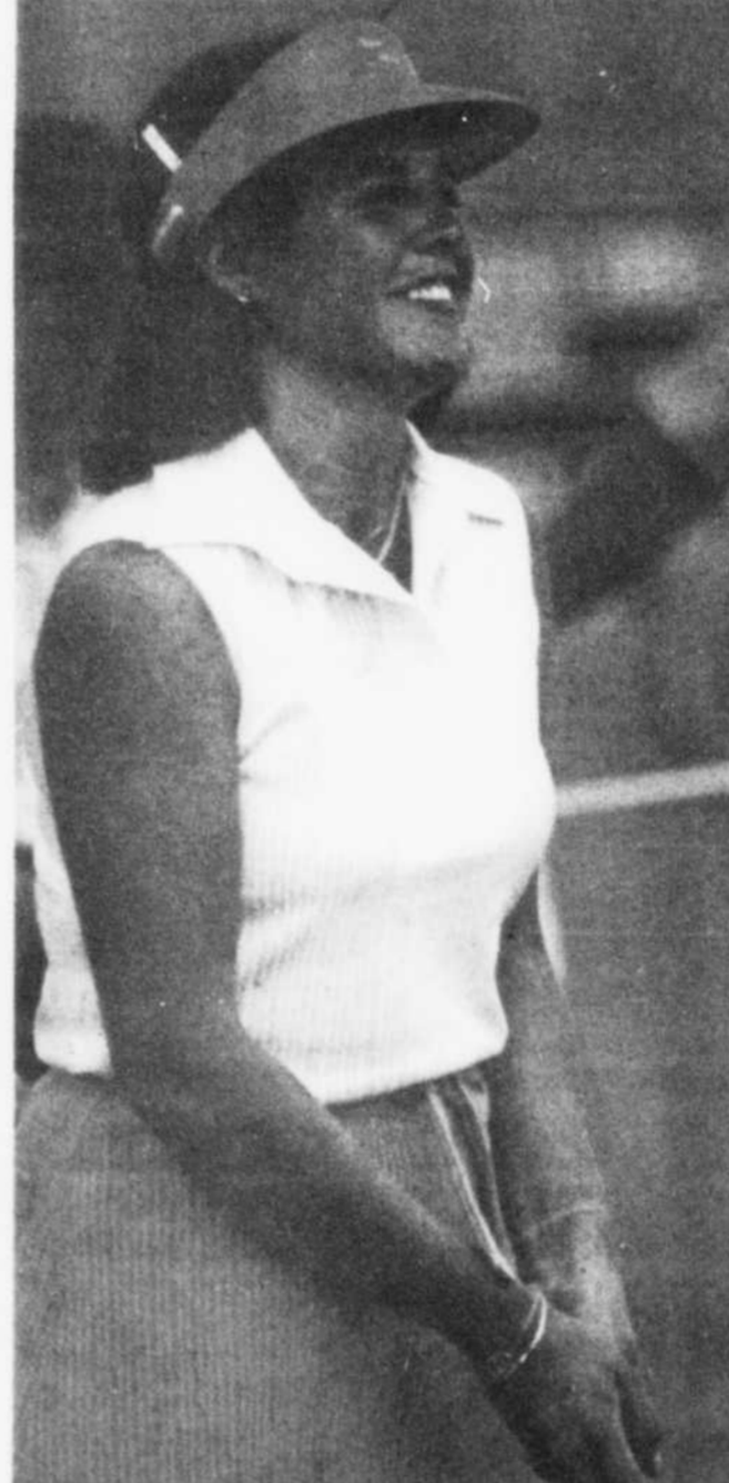
NANCY LOPEZ... seventh victory of year.