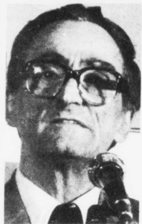
CLAUDE RYAN... Grits will steamroll PQ

ST. GEORGES-DE-BEAUCE, Que. (CP) — Claude Ryan predicted confidently Sunday night that his Liberal party is about to run over the Parti Quebecois government of Rene Levesque like a steamroller.