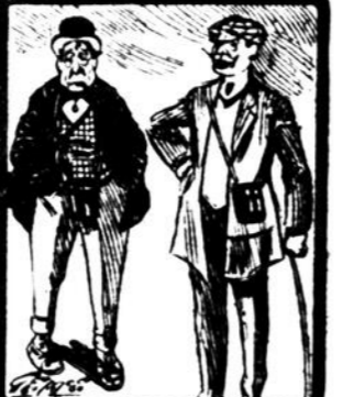
Impressions at Blue Bonnets.

Drowning Boy Pulled Out of Strong Current by Guardian Lessor, of the Baths.