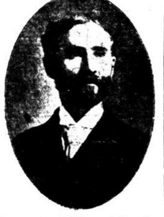
Impressions at Blue Bonnets.