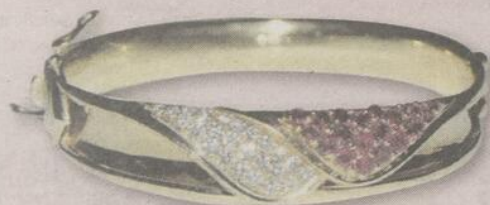
Ruby & diamond 18 k bracelet.

WE BUY: always offering best prices for gold, diamonds, quality estate jewellery, signed costume jewellery, all sterling silver, fine art and collectibles.