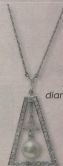
Art Deco diamond & Pearl

Monday - Friday 10am - 6pm Saturday 11am - 4pm