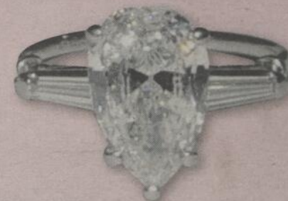
2.5 ct Diamond ring. Platinum.

Merry Christmas and Happy Holidays to all our clients and friends!