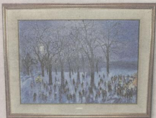
Oil on canvas, Molly Lamb "Burning The Christmas Tree" Fredericton, New Brunswick

We regularly conduct estate evaluations and liquidations for private clients and financial institutions. Ask for a free quote.