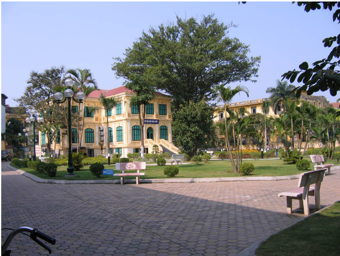
Figure 3.1 The new Hang Trong Park offers very few recreational options to users.

However, Hanoi can hardly meet the demand of its citizens for public space. Recreational areas, in particular, are insufficient to serve the urban population. Urban parks account for only 0.3% of the city's territory and represent less than 1m 2 per person. These figures are far below the urban park area offered by other cities in the region. Bangkok, to take only one example, has nearly twice as much urban park area than Hanoi (1.8 m 2 /per capita, see Thaiutsa et al. 2008).