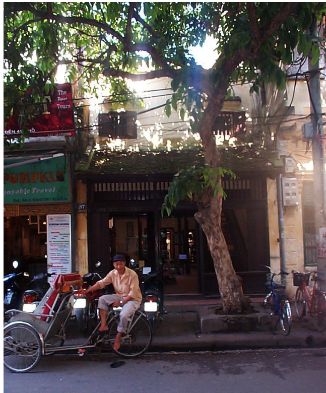
Figure 2.1 Traditional shophouse in the Old Quarter

The city's architectural and urban heritage combines exceptional monuments and compounds such as pagodas, temples, the citadel, and government buildings scattered through the urban fabric. Hanoi also displays exceptional urban ensembles. The core of the city consists of a traditional merchant quarter dating back to feudal times. This area is characterized by an organic network of narrow streets lined with traditional shophouses (see Fig. 3.1) (Pham Dinh Viêt 1997).