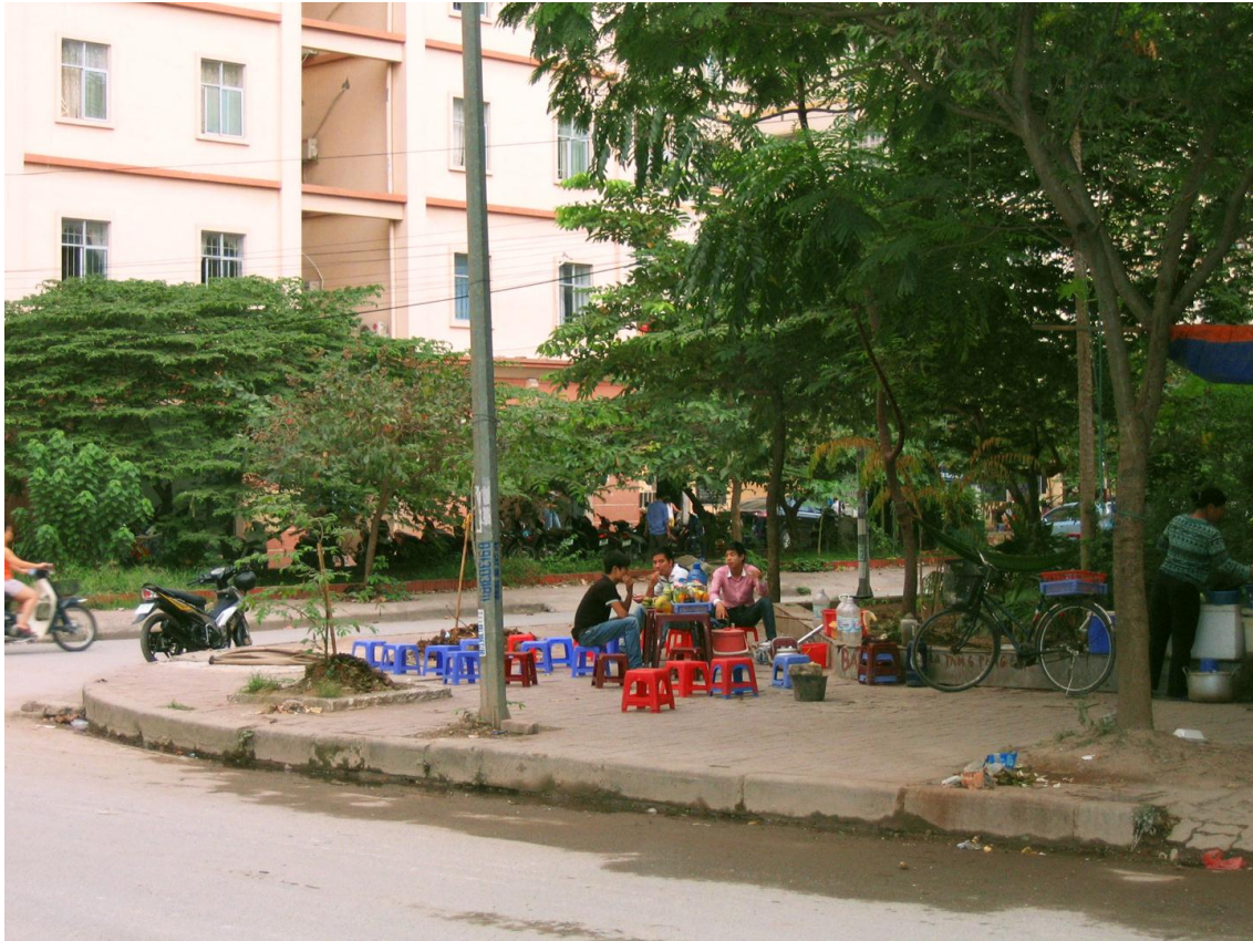
Figure 3.3 Sidewalk spaces are extensively used in the new urban areas of Hanoi.

attempted to regulate sidewalk use more strictly, prohibiting mobile vending and controlling some of the private appropriation of public space by shop owners (Kurfürst 2009; Koh 2008). Yet, even the most regulated sidewalks of Hanoi cannot replace safe and accessible public parks where residents can get away from traffic and air pollution, enjoy larger playgrounds, and make use of quality community meeting spaces.