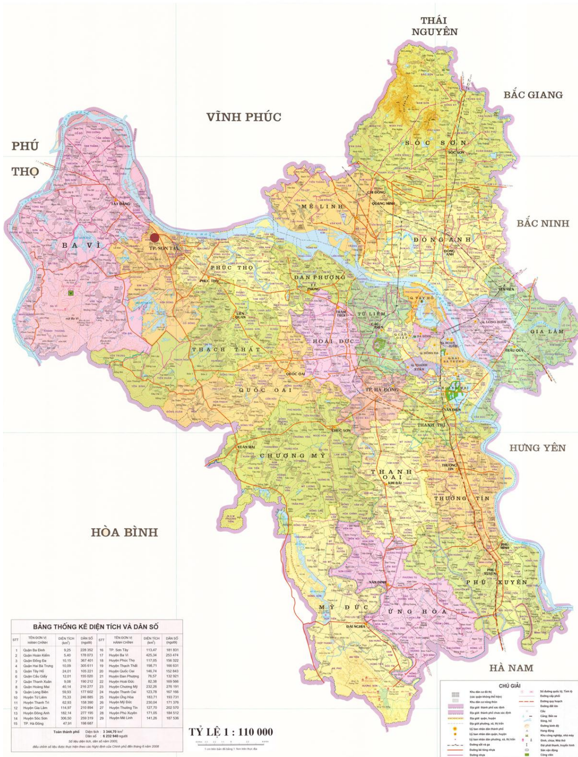
Figure 1.1 Map of the Hanoi city-province