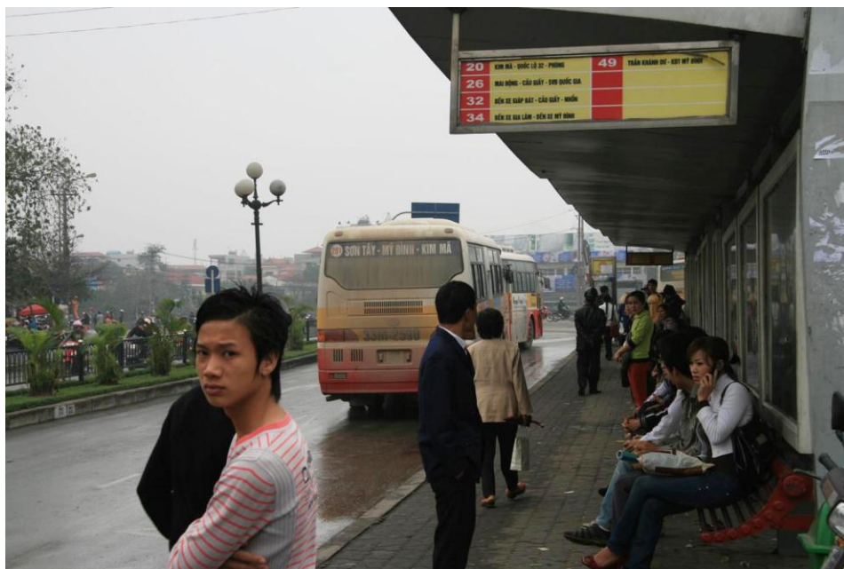
Figure 4.3 Passenger waiting for the bus in Hanoi

Public transportation once played a significant role in the capital's urban transportation system, namely, in the early 1980s, when the modal share of buses accounted for 25 to 30%. However, the number of routes and the frequency of the service then decreased in the 1990s, when subsidies for state-owned enterprises began to get curtailed (JBIC 1999: III). Public transportation nearly collapsed entirely in the late 1980s when ridership dropped from about 40 million per year to almost nothing (HAIDEP 2007: 8-7). For more than ten years, Hanoi thus seemed to be establishing itself as a non-public transit city. To counter this direction, the national government recently launched a new policy that places public transportation as a priority over other urban concerns. Among its ambitious targets for Hanoi is the stipulation that 25 to 30% of trips in 2010 and 50 to 60% in 2020 must be carried by public transportation 7 (HAIDEP 2007: 8-7).