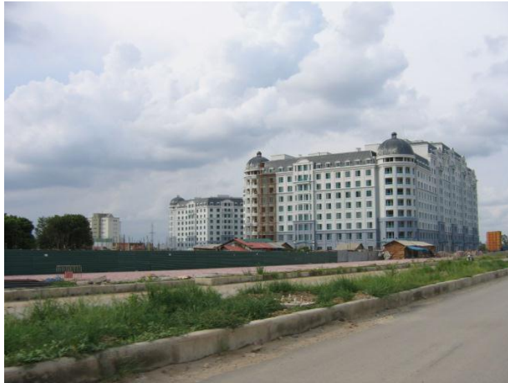
Figure 5.2 “The Manor,” a new urban area on the outskirts of Hanoi

This self-help housing production contributed to decrease unsustainable housing densities in the inner city. Between 2000 and 2008, average housing areas per capita went up from 4.7 m 2 to 7m 2 (VNS 2009; JBIC 1999). Yet, self-help housing has systematically been appraised by local experts as a sub-optimal answer to the housing shortage in Hanoi. One of the main problems is that a large proportion of the dwellings so produced do not qualify for basic neighbourhood infrastructures, including environmental utilities and services such as clean water and electricity. The spatial landscape ensuing from this informal urbanization is also considered as disorderly and unsuitable for the capital city of a modern, developed, and civilized Vietnamese nation (PHC 2000; Nguyen Xuan Mai 2001; Lru Trọng Hải 1995).