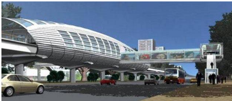
Figure 4.4 Artist's rendering of a light-rail transit station in Hanoi

In light of the fact that the above-mentioned traffic congestion limits the attractiveness and impacts of a public bus system, new rapid mass transit (RMT) projects operating outside the regular road network are currently on the drawing boards. Following recent recommendations from the Japanese International Cooperation Agency (JICA), two bus rapid transit (BRT) lines are awaiting funding approvals by the World Bank. In parallel, two rail-based projects are also in the making: a 12.5 kilometre east-west light rail transit line partly financed by France and a new metro line linking downtown Hanoi to its international airport (15 kilometres to the north), financed by the Japan Bank for International Cooperation (JBIC) (see Fig. 5.4) (ISTED 2006). These two projects were originally expected to be completed for the Hanoi's 2010 millennium celebrations but have suffered significant delays.