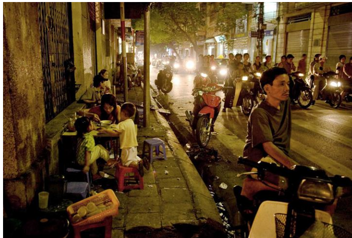
Figure 3.2 Multiple uses of sidewalk space compete with each other

The lack of formally designated and easily accessible urban public parks is informally compensated by the extensive use of the sidewalk and street spaces in the inner city. The sidewalks of Hanoi are the site of an eclectic array of activities spanning domestic, social, recreational, and commercial uses (see Drummond 2000 for a discussion). Such practices often result in conflicts between public uses and the private appropriation of public space (see Fig. 4.2).