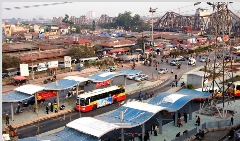
Figure 4.5 New buses interchange at the foot of the Long Bien Bridge