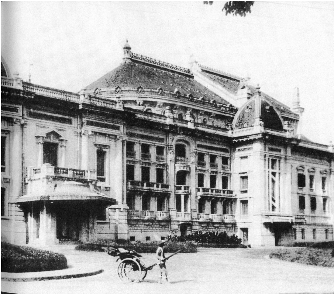
Figure 1.3 Hanoi's opera house was built during the first decade of the 20th century.