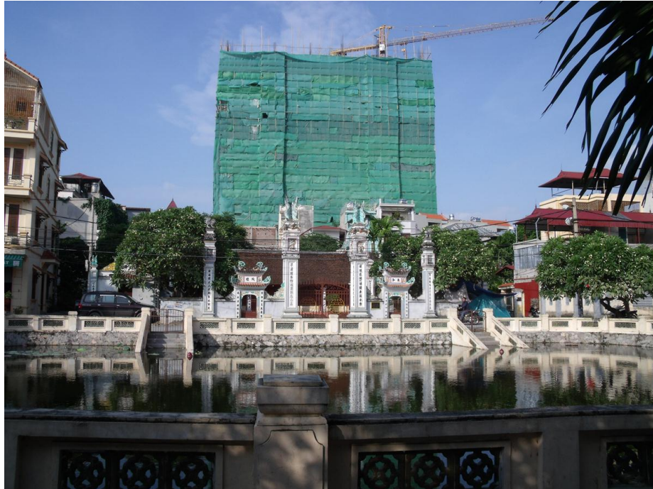
Figure 6.1 A new high-rise building overlooks a traditional building in a peri-urban village under urbanization.

For four decades Hanoi remained confined within limited space. Under the influence of a planned economy, lack of foreign investment, and moderate population growth, the city was restricted to its four central administrative districts. The city's built fabric only started to overflow into suburban districts in the early 1990s. And, at the turn of the century, urban expansion really began to accelerate with the relaxation of state control over rural-to-urban land-use conversions. Since then, thousands of hectares of agricultural land and hundreds of erstwhile rural communities have been engulfed into the city's physical and functional space (see Fig. 7.1). The scope and speed of these changes pose an enormous challenge for local populations who face intensive socio-spatial transformations as well as for planning authorities who are struggling to cope with new demands for urban infrastructures, services, land uses, and environmental controls.