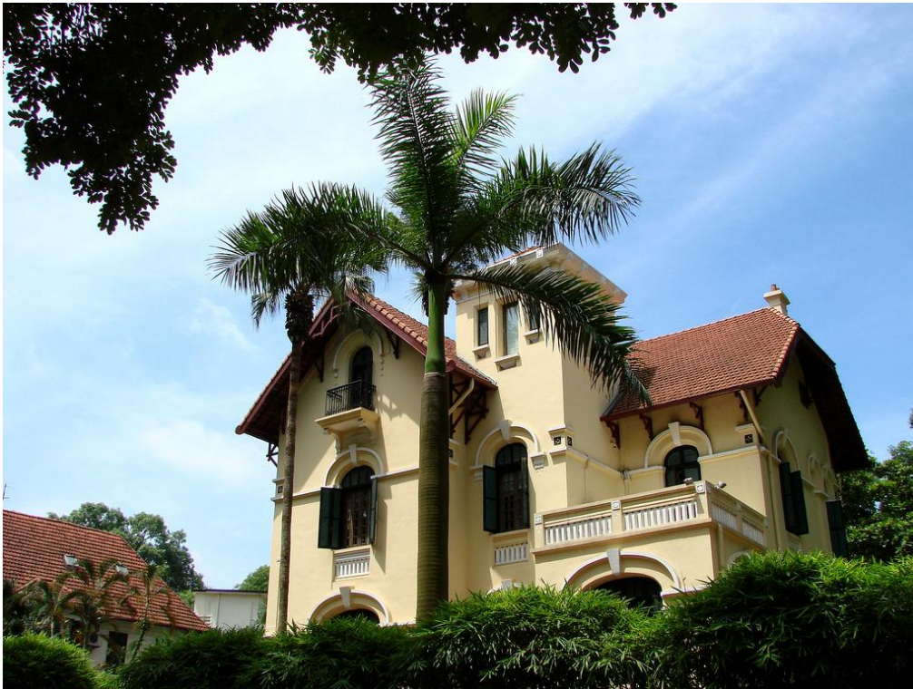
Figure 2.2 Colonial villa

South of the Old Quarter is the Colonial Quarter, an area planned under the French that functioned as the administrative and commercial centre of Indochina. As mentioned, this area is characterized by a regular street grid of broad avenues, lined with trees and flanked by luxurious villas (see Fig. 3.2). Hanoi's urban fabric further includes a myriad of erstwhile rural villages now engulfed into the urban fabric. The city is also characterized by a unique natural environment with numerous rivers and lakes, tree-lined streets, and parks.