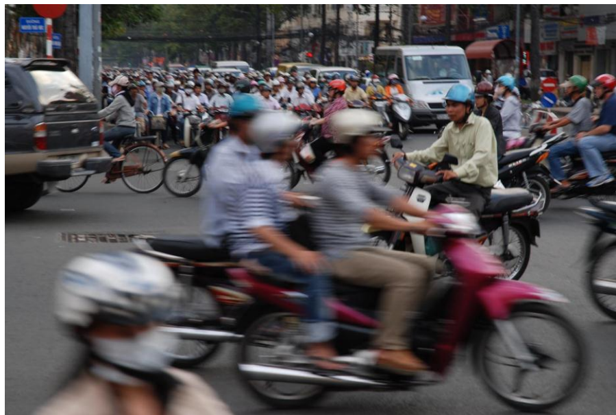
Figure 4.1 Hanoi's streets look like a continuous stream of motorcycles.

The rapid motorization of Hanoi is characterized by a predominance of motorcycles. Since its introduction to Vietnam during the subsidy era, this small four-stroke, two-wheel vehicle has become a symbol of high personal mobility, an asset value, and one of the most convenient means of transportation in a city the urban fabric of which is dominated by narrow alleys (JBIC 1999). Motorbike ownership in Hanoi is reaching high rates compared to income levels, and this despite high import-taxes (70% to 100%) and registration fees. Four households out of five in Hanoi own a motorbike and two out of five own at least two (AFD 2008).