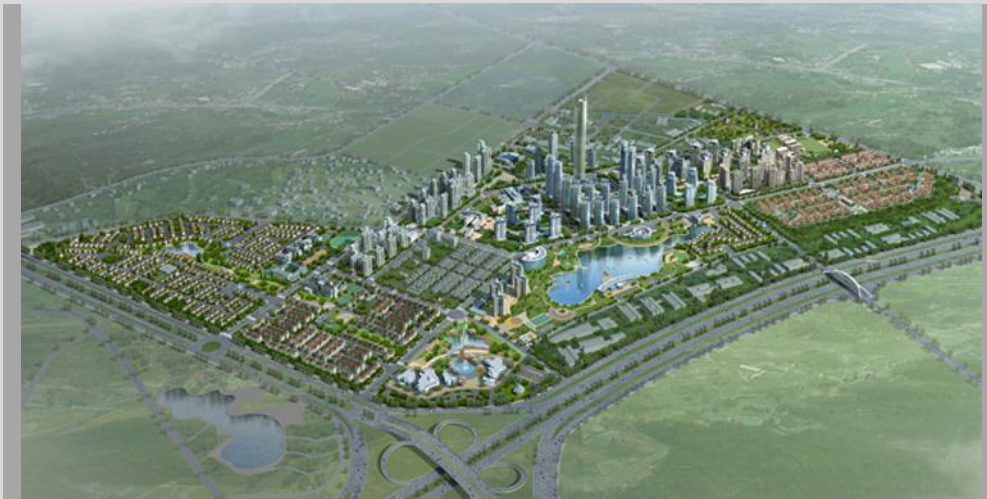
Figure 5.3 Bird's eye artist rendering of Splendoria