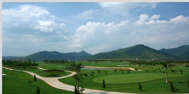
Figure 6.4 A new golf course in the region of Hanoi.

Source: Thanh Nhien 2009; Tran Thai 2008