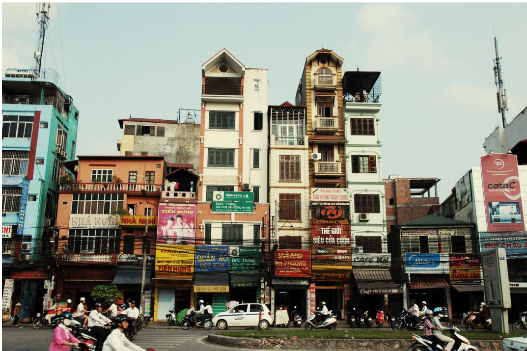
Figure 5.1 Houses produced by individual households in the 1990s

The adoption of the Doi Moi policies greatly influenced housing production in Hanoi. Major changes included the withdrawal of public housing subsidies and the encouragement of an emerging private housing development sector along with traditional self-help housing production (Trịnh Duy Luân 1995; Thuc Huy Trinh 2005). In the 1990s, the progressive removal of state control over the housing and construction market conflated with newly-formed private capital to foster a construction boom mainly driven by informal self-help housing practices (see Fig. 6.1) (Everestz 2000; Parenteau 1997).