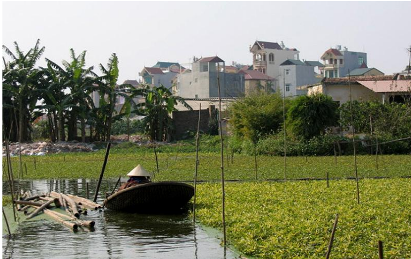
Figure 6.2 Typical peri-urban landscape juxtaposing aquaculture and new houses

and market gardening with crafts and semi-industrial activities such as basket weaving, metallurgy, textiles, and food processing. This combination of activities required a large workforce and fostered very high population densities: 1,200 inhabitants/km 2 on average, up to as much as 15,000 inhabitants per km 2 in residential areas (Fanchette 2009: 4).