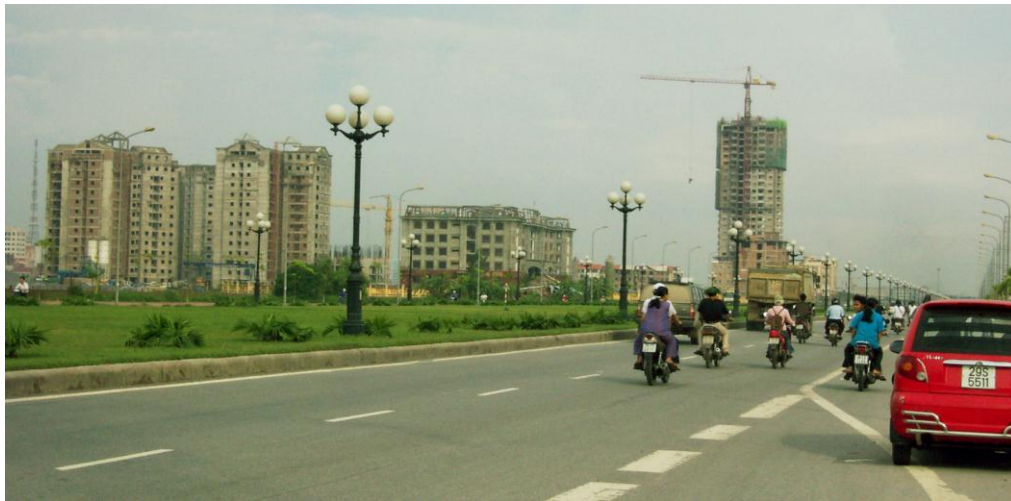
Figure 6.3 High-rise buildings in an NUA under construction on the western edge of Hanoi

Throughout the 1990s, conversion of agricultural land to urban uses took place informally at a very small scale. The formal rural-to-urban conversion of large tracts of agricultural land was tightly restricted by the state, requiring approval from the Ministry of Natural Resources. At the beginning of the 2000s, the state relaxed its grasp on the management of these spaces and, in 2006, decentralized the power to approve and convert land uses down to provincial and municipal governments. This fuelled a real estate market boom all over Hanoi's peri-urban territories.