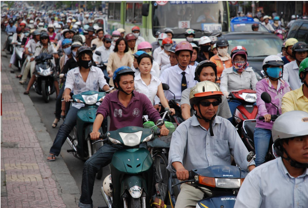
Figure 4.2 Traffic jams are increasingly common in Hanoi.

The already overloaded and weak traffic infrastructure of Hanoi is bearing increasing pressure. The road network represents less than 7% of the land area (compared to about 15% in most European cities and 11% in China's large cities). An expansion of the road system is restricted by the severely high cost of resettlement, which constitutes over 80% of a given project budget. Over the last decade, travel speed and travel time in downtown Hanoi have worsened not only due to traffic congestion but also to longer travel distances. The latter is fostered by a master plan prescribing the decentralization of spatial structures, which further exacerbates the need for transportation linkages between the city centre and the suburbs (ABD 2006).