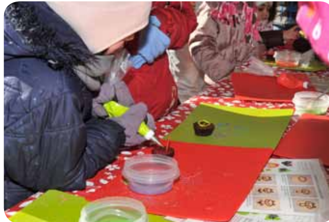
Pas moins de 1000 petits gâteaux se sont envolés pendant l'atelier. No fewer than 1000 cupcakes were devoured during the workshop.