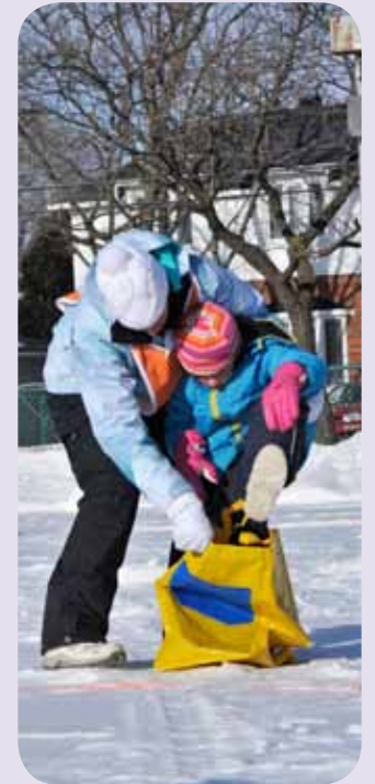
Dans le sac pour la course à relais! The relay race is in the bag!