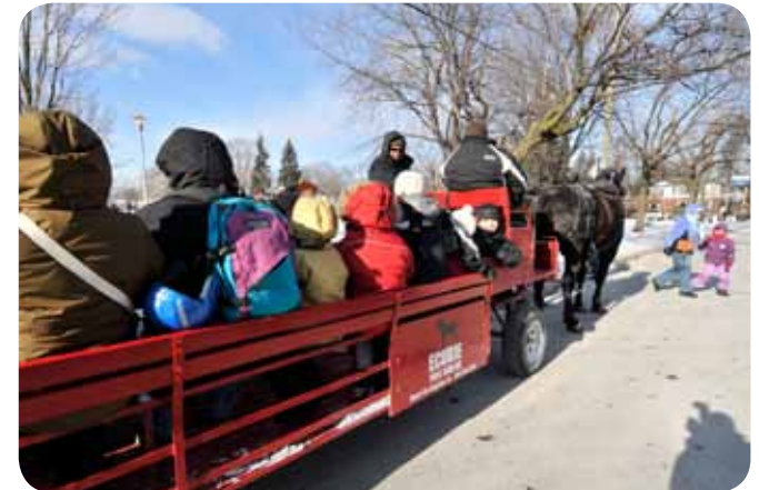
Les tours en carriole sont toujours l'une des activités préférées à la Féerie. The horse-drawn carriage rides are always a favourite during the Féerie.