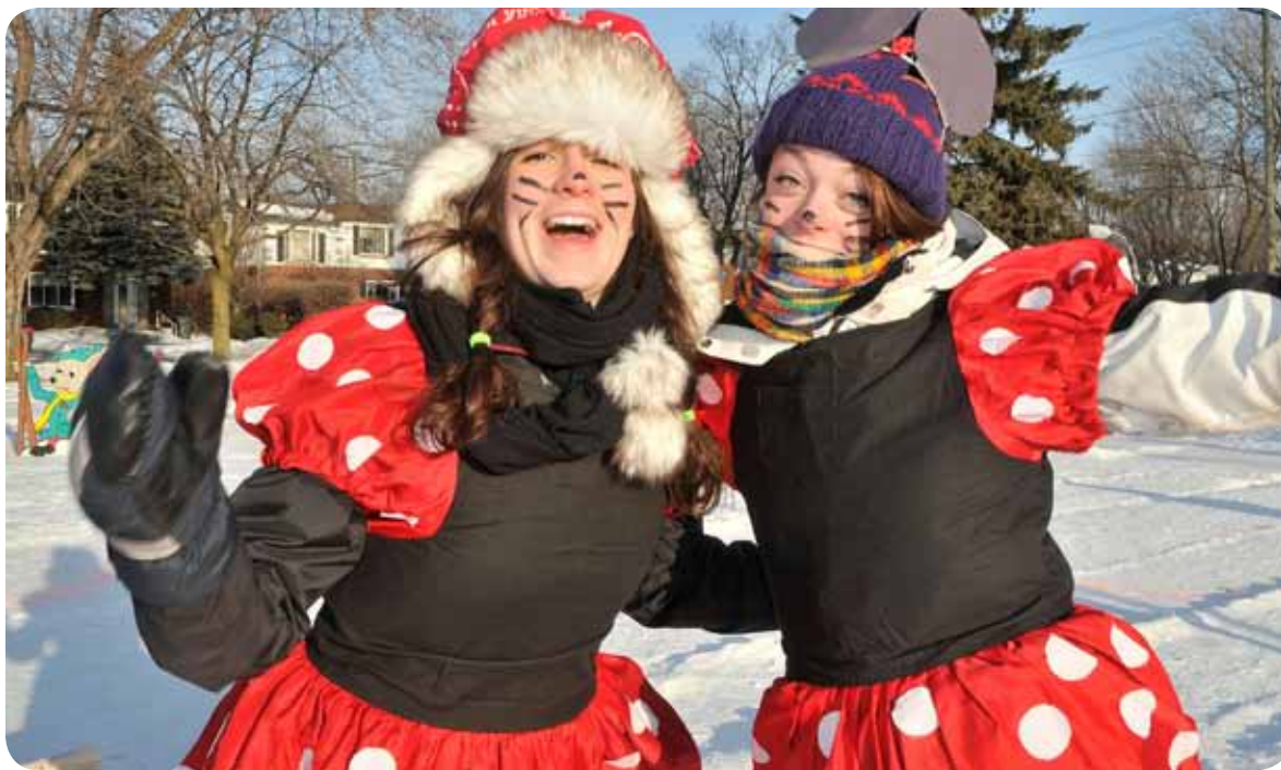
Deux souris Minnie bien habillées pour braver le froid. / Two Minnie mice dressed for the cold!