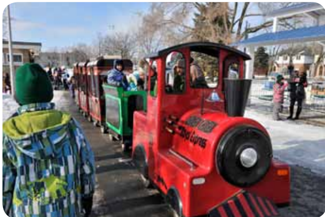
Le Royal Express ne s'est pas désempilé de l'après-midi. The Royal Express ran all day long.