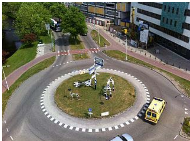
Figure 5 A bike path outside the lanes of a roundabout

These are generally set back one or two car lengths from the entrances into the roundabout. Pedestrians use the same lane.