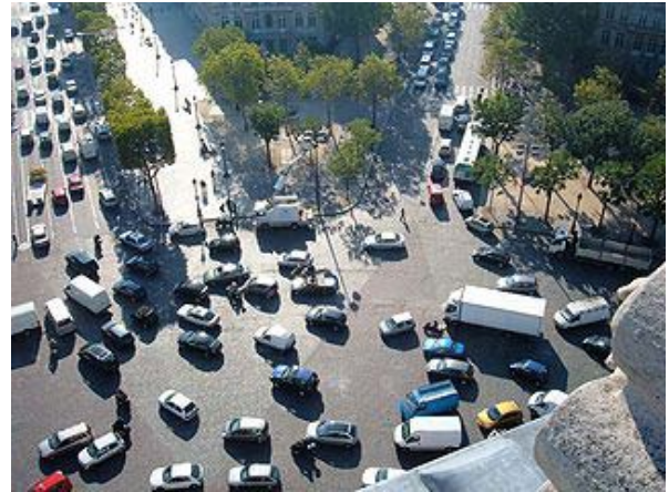
Figure 1 The traffic circle at the Arc de Triomphe, in Paris

The roads are at right angles to the circle. Priority is given to cars entering the circle. Pedestrians have access to the centre.