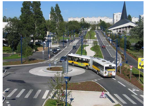
Figure 2 A multi-modal roundabout