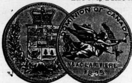
Gold Medal, London, 1885.