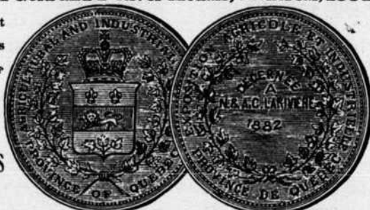
The only Prize Medal, Montreal, 1882.

5 Gold Medals, 5 Silver Medals, 2 Bronze Medals, awarded to