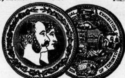
2 Gold Medals, Toronto, 1888-89.

N. & A. C. LARIVIERE is the only firm in the Province of Quebec which has won Gold Medals, and the only one in the Dominion of Canada which was awarded 5 Gold Medals for Carriages and Sleighs.