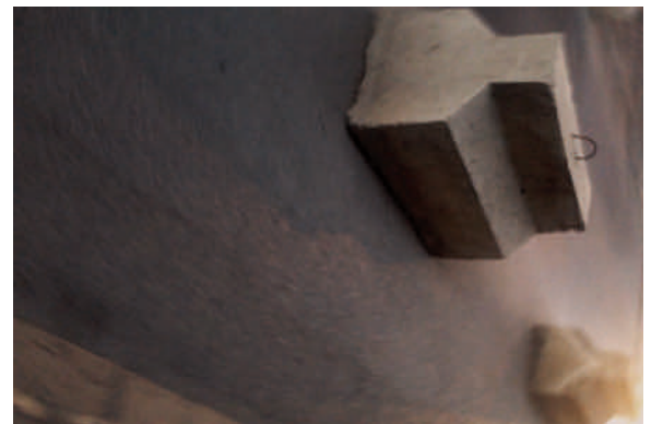
Video stills from The Color Remains the Same , 2015.