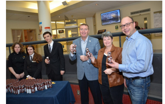
Laiterie de l'Outaouais – Perseverance Event