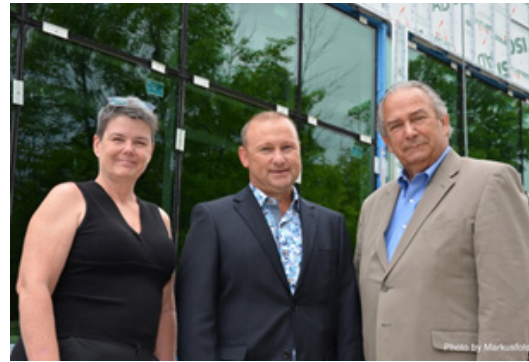
Vitrierie de la vallée - Major Donor