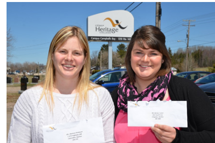
Bursaries – Pontiac Perseverance Bursary Recipients