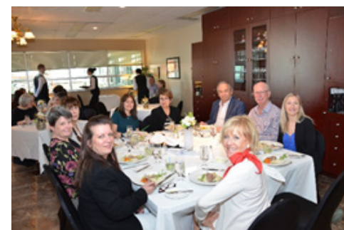
Networking Lunches at the Heritage Bistro