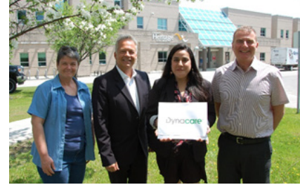
Bursaries – Dynacare (Nursing Bursary)