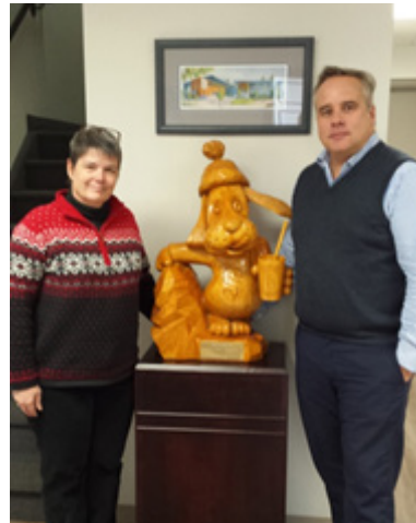
Slush Puppie Canada Inc. Donation