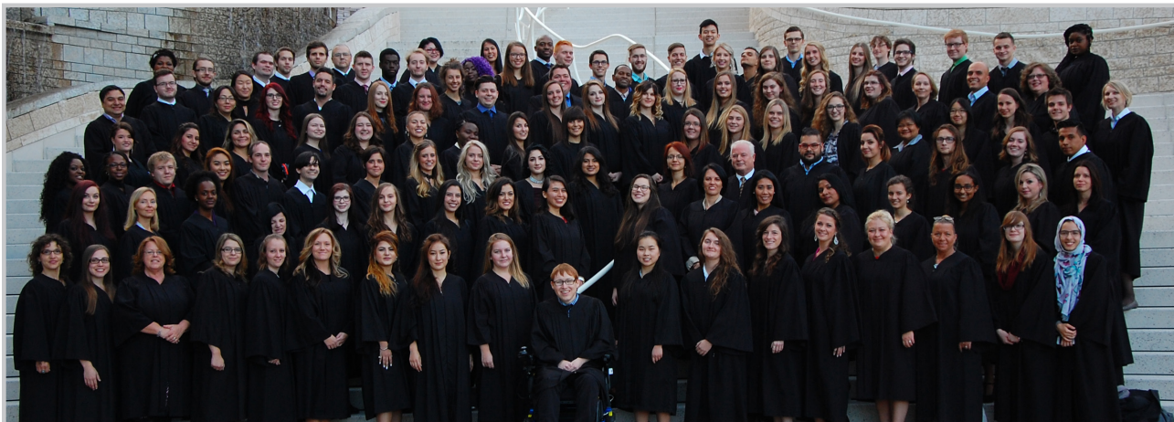
Cégep Heritage College Graduating Class of 2016