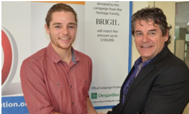
BRIGIL –Lead Donor – Matching Family Donations