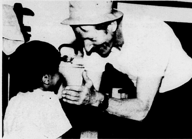
RECEIVES AWARD - Film star Danny Kaye, will be presented with the Prime Minister's Award at a dinner of tribute, tendered by State of Israel Bonds, in the Shaar Hashomayim Synagogue May 26. In this photograph, taken on a recent visit to Israel, Danny Kaye brings smiles to the face of a little patient at the Alyn Hospital for Crippled Children, in Jerusalem.