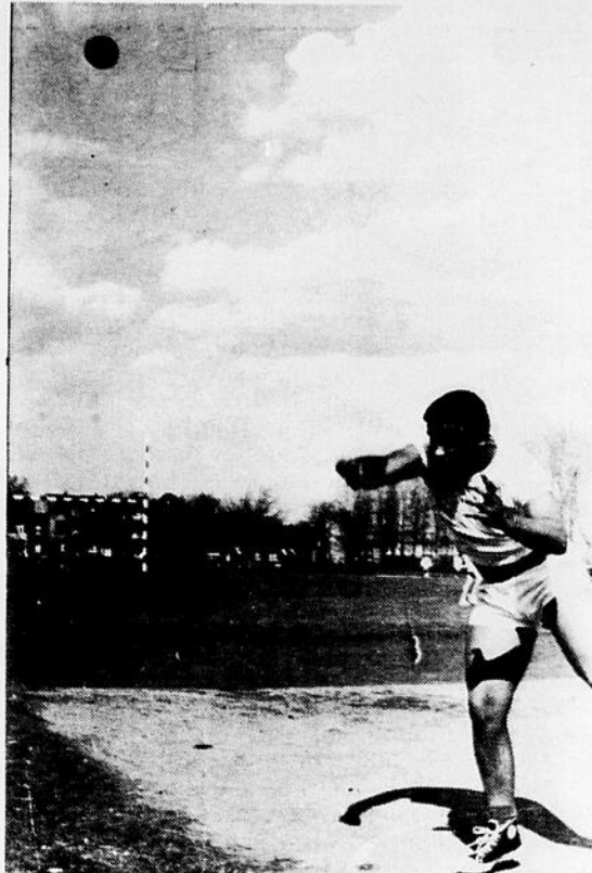
TRACK AND FIELD ARRIVES AT WESTMOUNT HIGH WITH SHOT PUT PRACTICE