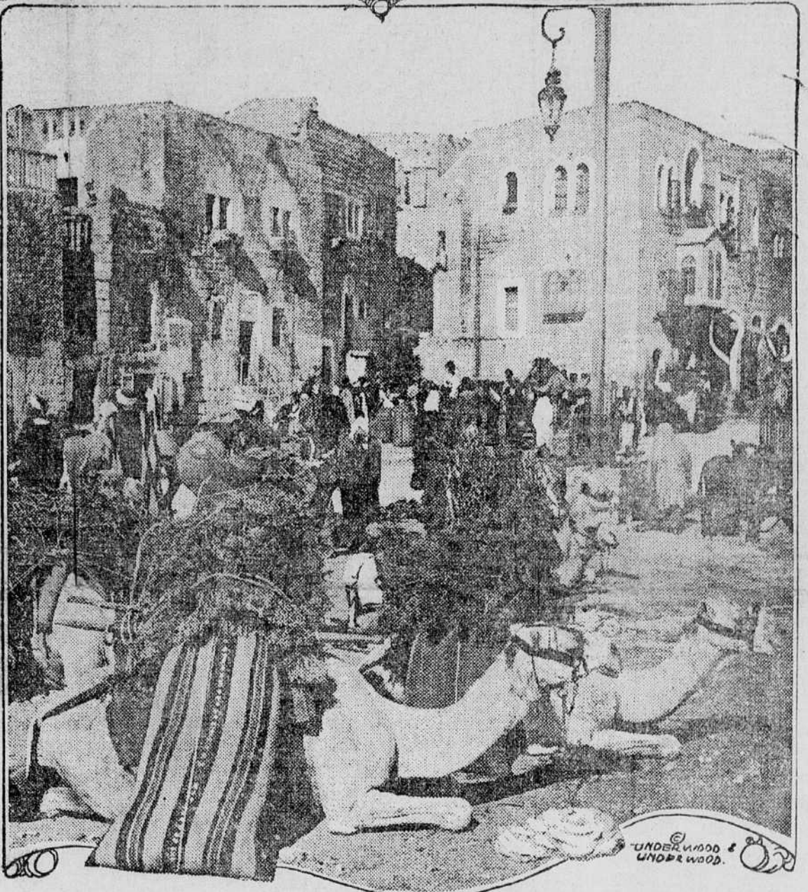
In the market square of Bethlehem where Joseph and Mary came seeking shelter on the eve before the first Christmas; the eve they took shelter in a stable, the birthplace of Jesus.

REMEMBER THE RED CROSS ON CHRISTMAS DAY Send a Dollar To-morrow for the E.T. Motor Ambulance