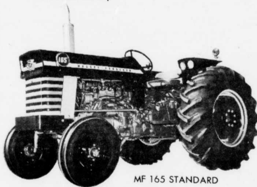
MF 165 STANDARD

Make ROMA MALOUIN Your First And Last Stop