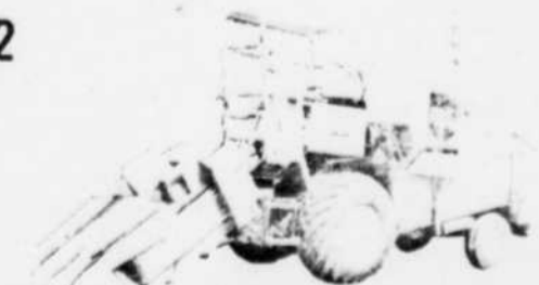
FRESH MARKET SWEET CORN HARVESTER