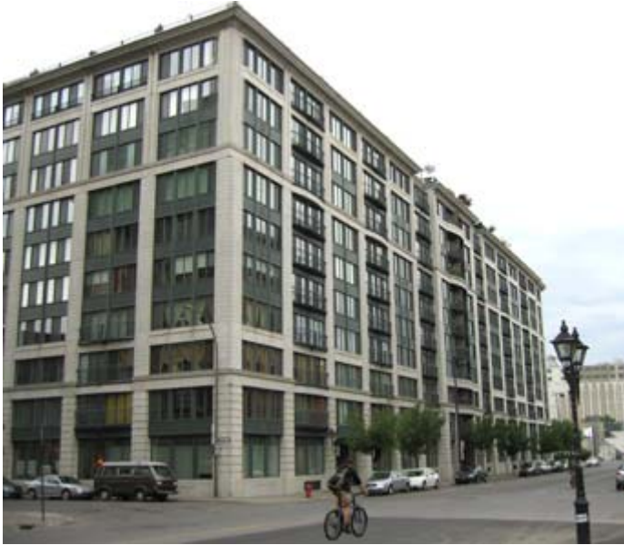
Residential Building 1 McGill

Among the sectors where the return on the investment has almost doubled for the 10 last years in Montreal, one has noticed the real estate and in particular the condominiums. The environment of Montreal literally changed since the last years and one could see the majority of the abandoned buildings to be transformed into luxury condo.