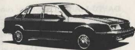
Chrysler Le Baron GTS 1985

BEST BUILT, BEST BACKED AND BEST PRICED!