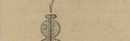
A HYDRAULIC TOP. The simple interior construction of the top is shown in the illustration.

The hydraulic top represented in the cut is described in Popular Science News as follows: It outwardly resembles an ordinary top, furnished with a cup shaped holder (B), on which it is placed while spinning.