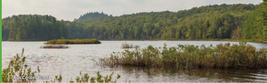
Aux Cerises Pond