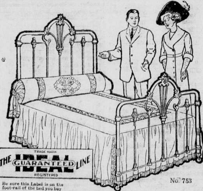
THE IDEAL BEDDING LINE. No. 753