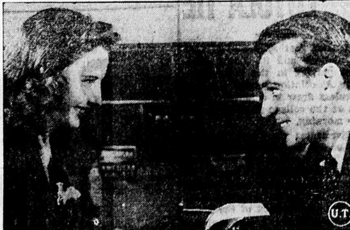
Barbara Stanwyck and Gary Cooper in a scene from the Frank Capra production, "Meet John Doe," which is now playing in its second week at the Snowdon United Theatre.