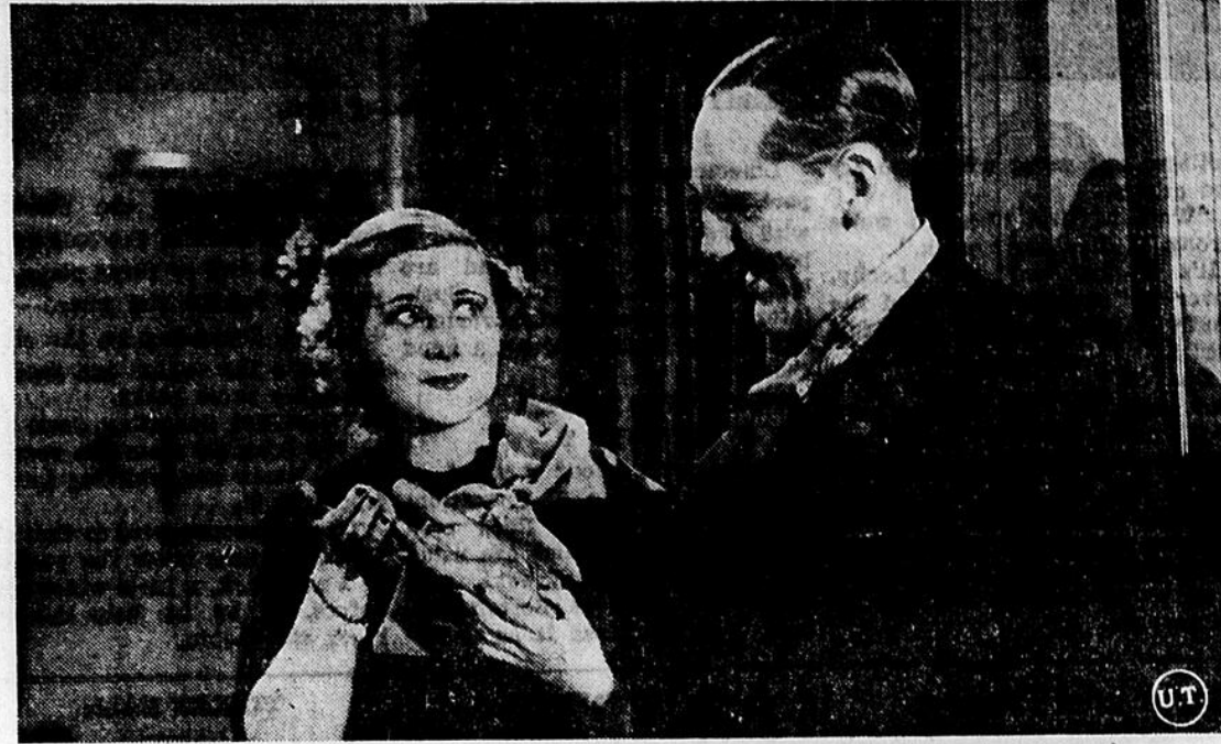
Genevieve Tobin and Britain's leading funster Jack Hulbert in a sparkling mystery treat in the gay Thin Man manner, "Kate Plus Ten," which is based on the story by Edgar Wallace, opening at the Snowdon United Theatre Sunday afternoon.