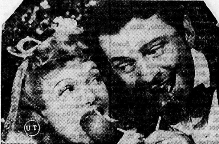
Anna Neagle and John Carroll as they appear in the delightful entertainment, "Sunny," which plays at the Monkland United Theatre on Sunday until Tuesday night.