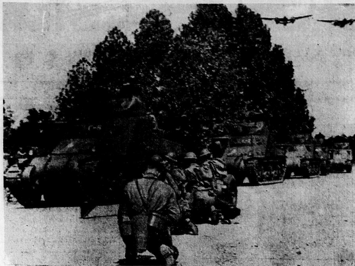
A column of the army's new M-3 tanks belonging to the first armored or "Old Ironsides" division, supported by A-20 attack planes of the Second Air Tank Force, of Barksdale Field, La., smashing into defenses and "taking" Castor, La., in current large-scale maneuvers. "Defending" the town were anti-tank units like that in foreground and a company of infantry.