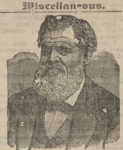
THE GREAT DR. DIO LEWIS