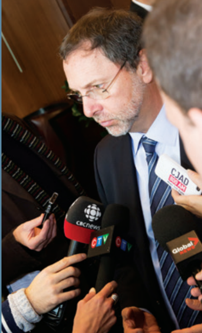
Employers Council spokespersons were more present than ever in the media in 2012.