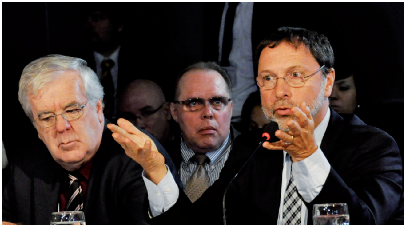
The Employers Council president along with other interveners at a meeting in Trois-Rivières in December 2012, ahead of the Summit on Higher Education

In February, the Employers Council participated in the Labour Minister's consultations on the Act respecting collective agreement decrees . While it held the view the current law, in general, still addressed the needs of the parties directly affected, the Council noted it would be worthwhile making a few revisions, notably in the definition of "class of employees" and the implementing of a unique qualification regulation, especially in the automobile sector. The Council also noted, in certain instances, there might be a need to review the inspectors' intervention method, but it would not entail increasing the involvement of the Labour Minister or stipulated third parties in the negotiations or operations of the parity committees.