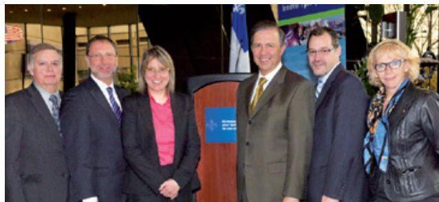
Members of the follow-up committee on regulatory and administrative simplification, along with former Economic Development, Innovation and Export Trade Minister, Sam Hamad.

In January, the Quebec government released the work group study on regulatory and administrative simplification, a dossier on which the Employers Council and its industry-sector associations were actively involved throughout 2011. A follow-up committee, comprised of representatives from the business community, including the Employers Council president, was set up to implement the report's recommendations. Meanwhile, Treasury Board of Canada president, Mr. Tony Clement, released the government's Red Tape Reduction Commission Report (for which the Council was also consulted) and the government's action plan for implementing the Commission's recommendations.