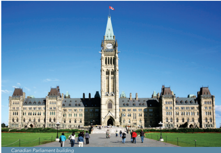
Canadian Parliament building