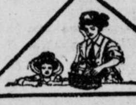
Servants and Children

The National Cash Register stands for these desirable things in any store.