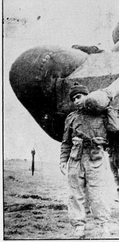
BEFORE MORE is said it had better be made clear that the British Tommies are carrying a dummy tank of inflated rubber, a weapon for confusing the enemy rather than attacking him. It was used on Salisbury Plain, England, when some 12,000 men and 4,000 vehicles of Britain's Territorial Army, roughly equivalent to the United States National Guard, took part in up-to-date maneuvers.