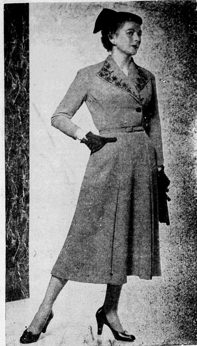
Emphasis is on the "easy" silhouette for Fall, and Alfandri has chosen an all-Viscose crepe to present it here in this afternoon frock. The cross-over bodice, with its jet embroidery, closes with one button and the skirt features side panels. (Viscose Information Bureau Photo).