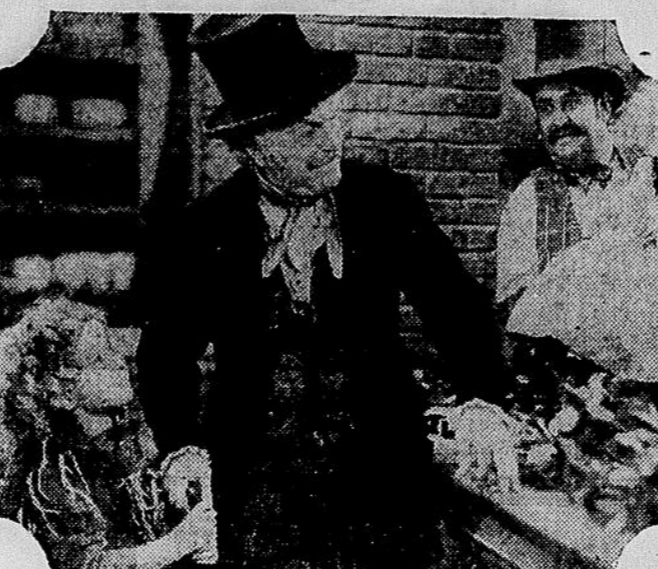
Shirley Temple, and Frank Morgan as they appear in "Dimples," which will open for three days at the Westmount Sunday, following at the Seville and then the Monkland.