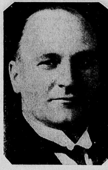
Present pastor of Calvary Church, who has occupied the pulpit since 1921. The church is observing its 60th anniversary this week end.