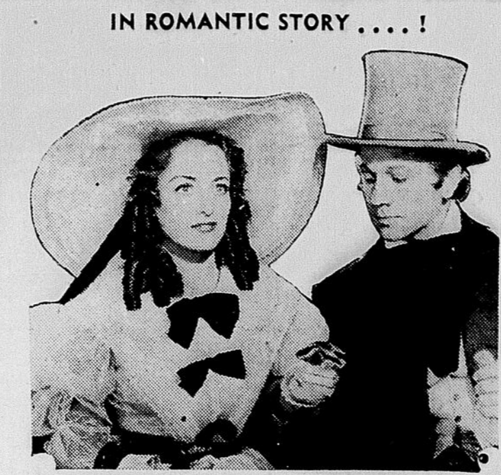
Joan Crawford and Melvyn Douglas in a scene from "The Gorogous Hussy," now at the Westmount United Theatre until Saturday night, opening on Sunday at the Seville and following at the Monkland.