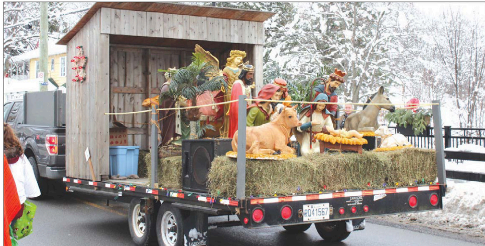
A Nativity scene on wheels