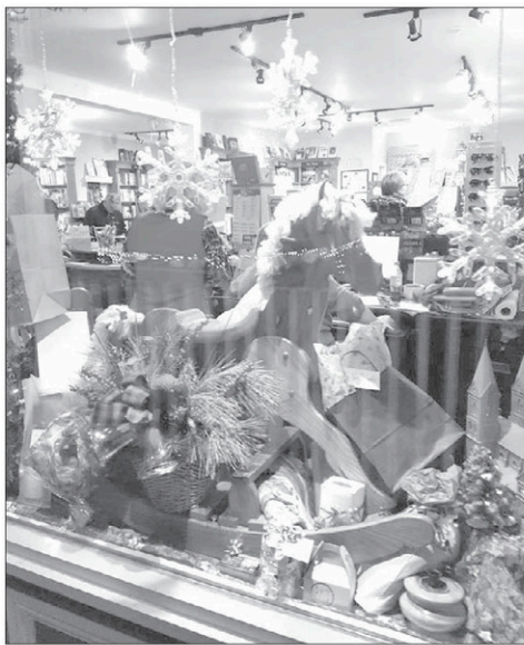
Midnight Madness prizes