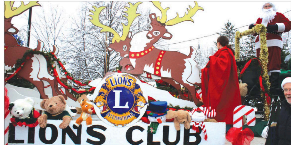
As usual, the man himself closed out the Lions Club Santa Claus parade Saturday in Knowlton.