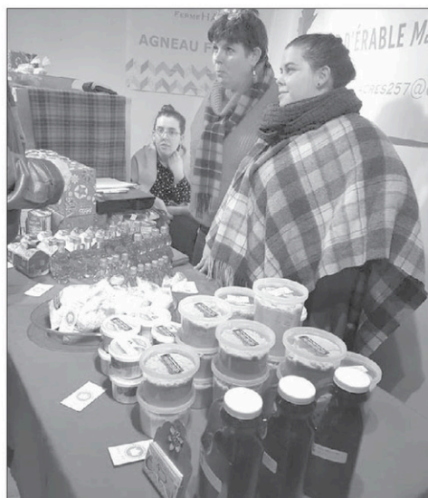
Local products offered at Midnight Madness