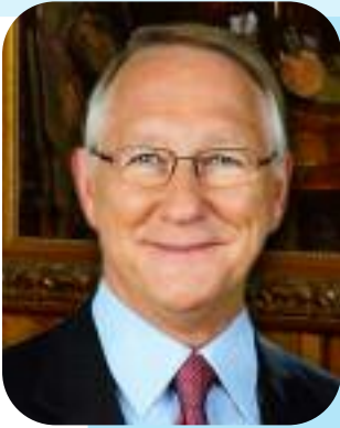
Gérald Tremblay Montréal Mayor

Citizens of Pierrefonds-Roxboro borough, you have in your hands the latest issue of Life in Pierrefonds-Roxboro , your borough's winter guide.