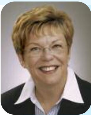
Monique Worth Borough Mayor