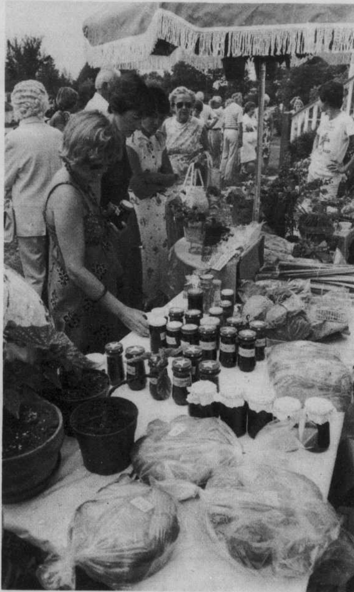
Fairs are a great place to try out some homemade treats.