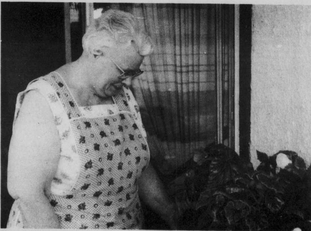
Also an avid gardener, Dobb had some of her flowers ruined in last week's storm.