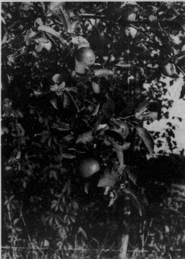
Reporter discovered new appreciation for apples after her visit to the orchard.