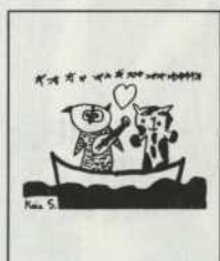
Double Take Theatre Productions