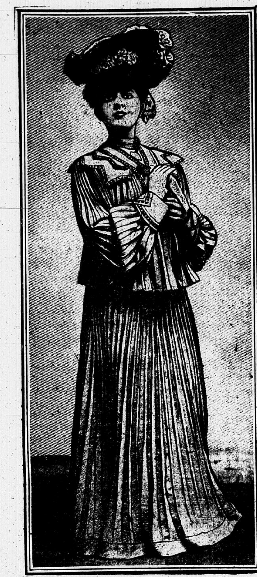
SUN-PLAID SICILIENNE. Of pale green Sicilienne flecked with white, this sun-plaided syndicate costume lends itself to almost any occasion. The little capes on the coat and hip yoke are edged with the new silk braid, and the skirt is bound at the edge with velvetine. The hat is of brown malinea, trimmed with roses and carnations.

WASHING THE HANDS. Beauty doctors are asserting vehemently that the only respectable and