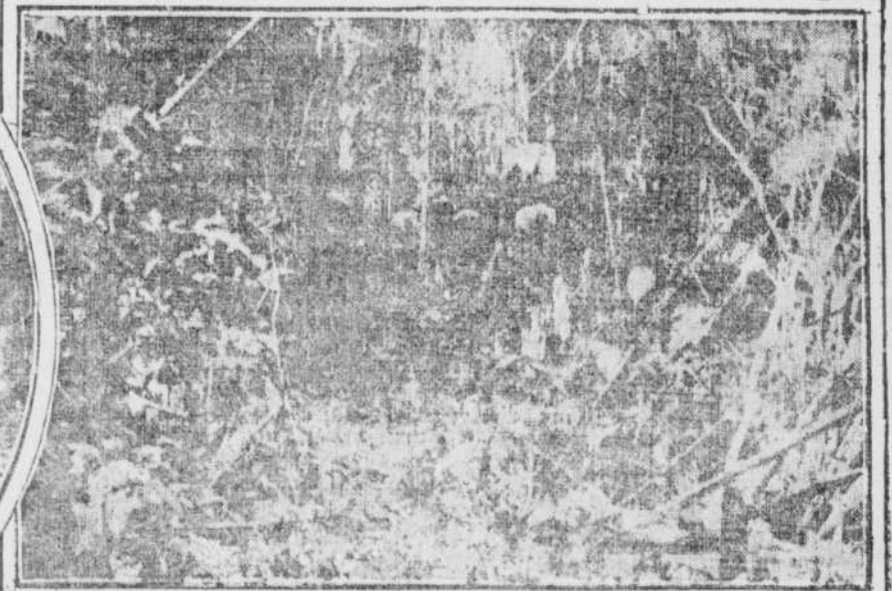
In the Heart of the Jungle—At the Beginning the Explorers Were Able to Travel on Blue Back, but Eventually Mules Were Abandoned and a Path Had to Be Hewn with Machetes.

After passing through a particularly fruitless tract, one night we found ourselves supperless. One of the men was digging for roots when he turned up a large, whitish worm. The man was famished. He snatched the thing up and ate it. It sounds horrible, but we were hungry; hungry in a way the man in civilization never knows. It gives me a feeling of revulsion to think of it now, but we all fell to digging and we made a feast that night of whitish worms. After all it is not much different from sitting in a fashionable restaurant with an orchestra playing and eating snails, which is considered a delicacy.