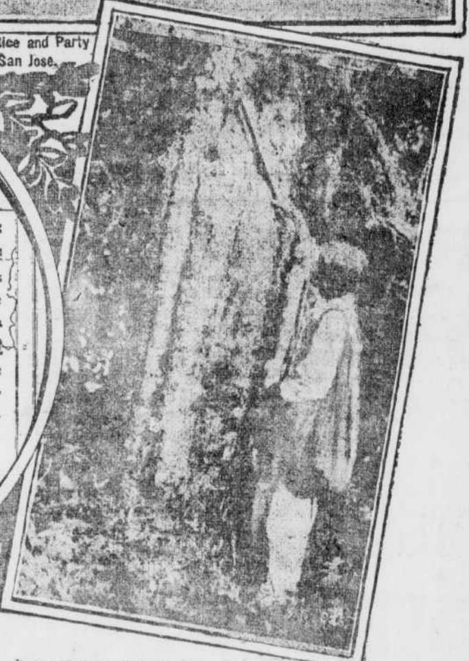
Rubber Gatherer Tapping Tree—To Earn Big Wages These Men Risk Their Lives in the Pestilential Jungle.