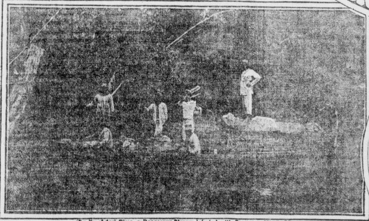
On the Ariari River, a Dangerous Stream Infested with Enormous Alligators.

to the other discomforts of the country the Ariari is infested by alligators, which lie sluggishly in the mud, sunning themselves, ready to dash at and rend anything, human or inanimate, which may jumble from a raft. At times our boats scraped against the scaly creatures, and the natives drew together far from the sides, gibbering in whispers and turning as pale as their tawny skins would allow.