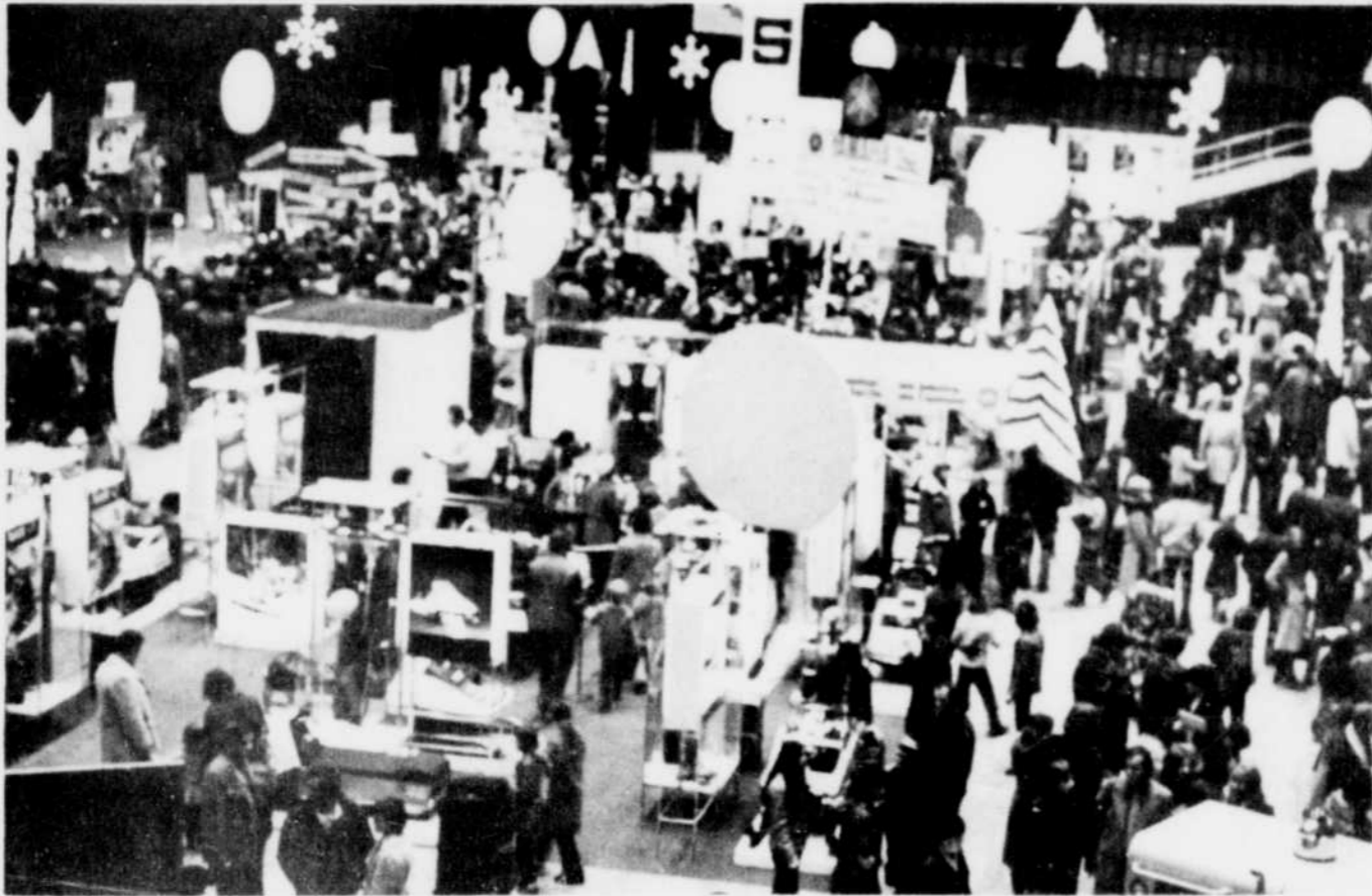
WINTER IS HERE — Thousands visited the 1972 version of the Salon D'Hiver held over the weekend at the Sherbrooke Sports Palace. Booths displaying all form of winter entertainment