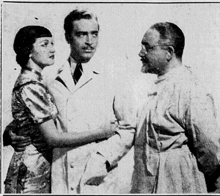
Dorothy Lamour, John Howard and Akim Tamiroff in a scene from the film "Disputed Passage" now playing at the York United Theatre until Friday.