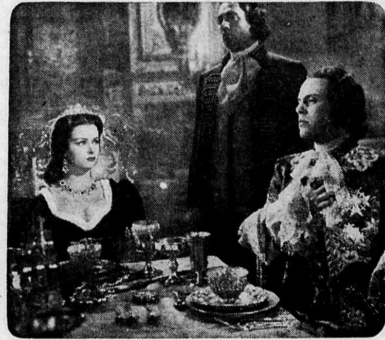
A scene from the film "The Man in the Iron Mask" starring Joan Bennett and Louis Hayward, opening Sunday at the Snowdon United Theatre for a three day engagement.