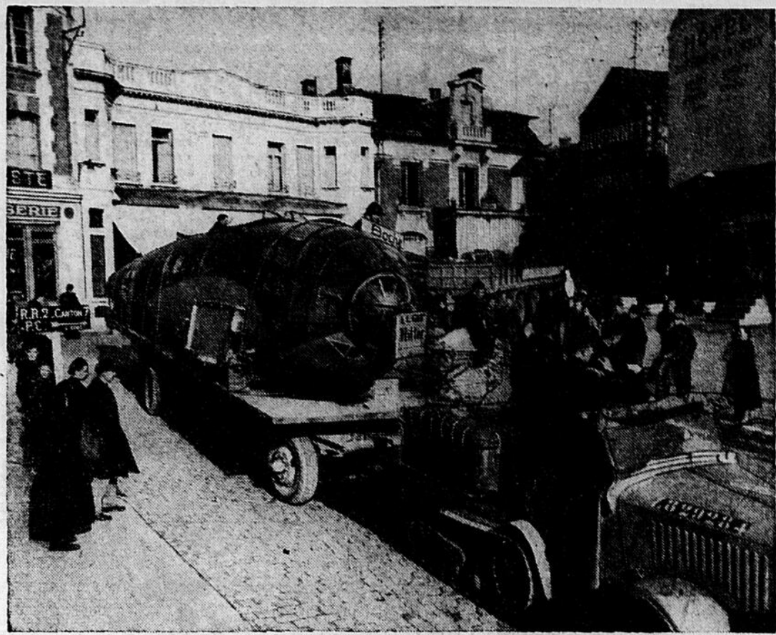
British and French Air Forces on the Western Front, working in close co-operation, are carrying out a magnificent work. In this photograph the fuselage of a big German plane is seen being towed through the streets of a French town, a trophy which will afford much valuable information to the Allies.