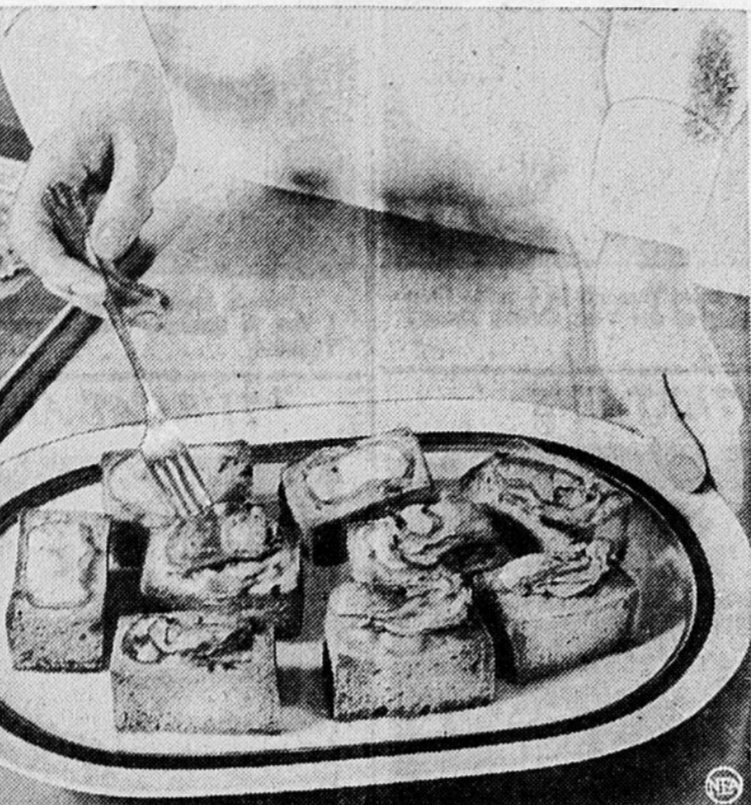
After the rich food of the holidays, the delicacy of oysters is welcome. Serve them in bread cases filled with chopped oysters and garnished with whole oysters, all attractively browned in a hot oven and generously brushed with butter.

Oysters R in Season — As a Delicate Flavor To Offset the Richness of Holiday Viands