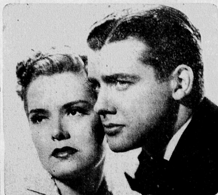
Brenda Joyce and Richard Greene in a scene from the film "Here I Am A Stranger" which opens Sunday at the Monkland United Theatre.