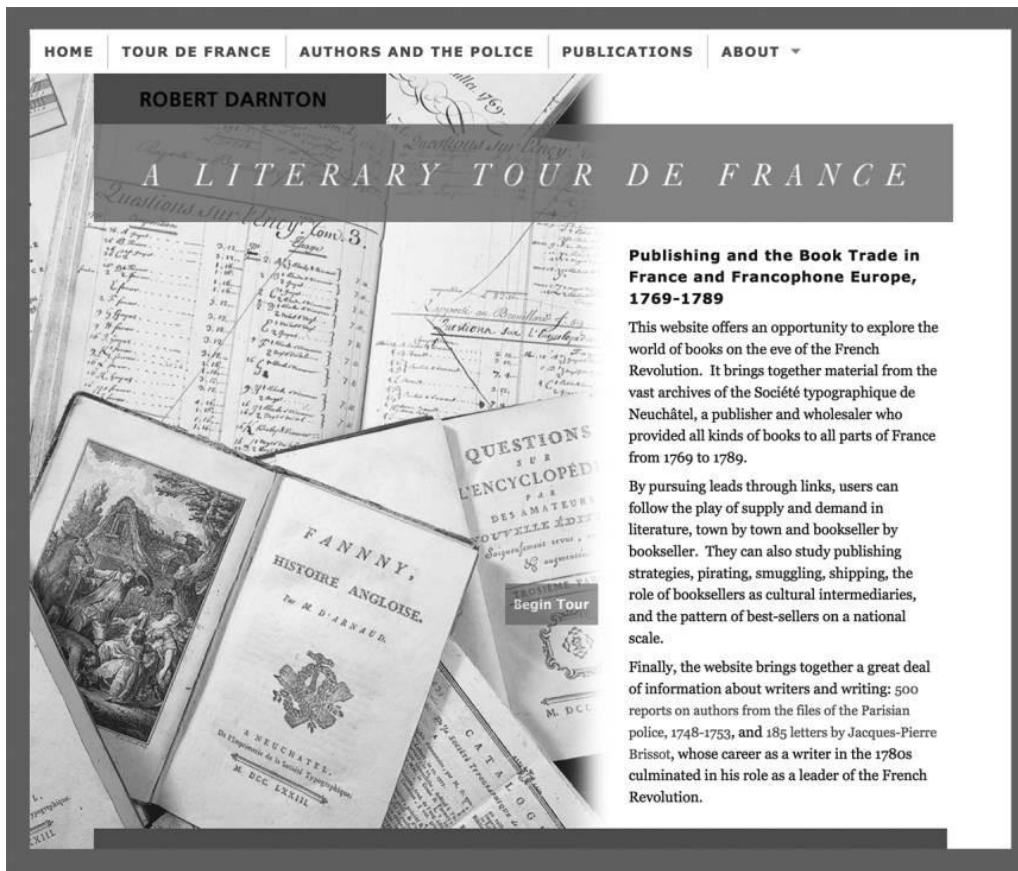
Figure 1: Home page of the website www.robertdarnton.org . A color version of this figure is available online.

It is arranged in layers so that readers can drill down and search across bands of information, pursuing interests of their own as well as the central question of literary demand. Before setting out, however, they are likely to raise questions about methods and sources. A third purpose of this article is to discuss those questions in a way that could be useful to historians in other fields who need to develop an effective research strategy.