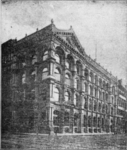
Montreal Building—Victoria Square.