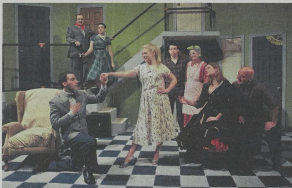
Actors running through a scene of Moon Over Buffalo .

Like the wildly successful presentation of Grove Hall's Lend Me a Tenor last year (also penned by Ludwig), the play calls for eight characters, played by many of the actors who took the stage for Lend Me a Tenor . What makes the play so original is that it is presented as a play within a play. The first act of the production portrays the actors performing in Cyrano de Bergerac , later transitioning to a scene