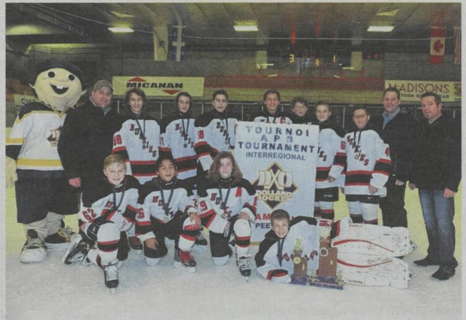
The Huskies lined up for a pictured with the Championship banner.