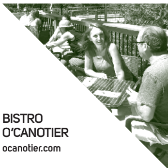
BISTRO O'CANOTIER ocanotier.com

Sample their smoked meat in a warm and inviting setting or enjoy a delicious gelato outside on their patio, located on the banks of the Rivière-du-Nord at the entrance to the village of Val-David!