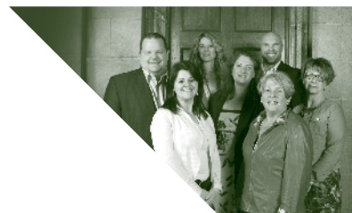
16 TH REGIONAL QUEBEC ENTREPRENEURSHIP CONTEST