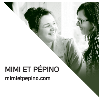
MIMI ET PÉPINO mimietpepino.com

The Le St-Amour urban grocery store in Mont-Tremblant features flavourful products and high-end kitchen utensils.