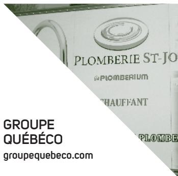
GROUPE QUÉBÉCO groupequebeco.com

Sample their smoked meat in a warm and inviting setting or enjoy a delicious gelato outside on their patio, located on the banks of the Rivière-du-Nord at the entrance to the village of Val-David!