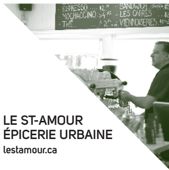
LE ST-AMOUR ÉPICERIE URBAINE lestamour.ca