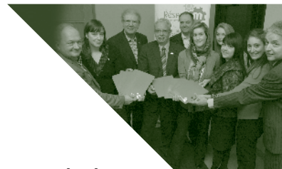
COMITÉ RÉGIONAL MENTORAT LAURENTIDES (CRMLAU - LAURENTIAN REGIONAL MENTORSHIP ADVISORY COMMITTEE)