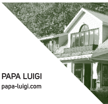
PAPA LUIGI papa-luigi.com

Featuring exclusive or rare products throughout Quebec, this St-Sauveur boutique stands out for the superior quality of its maternity and baby products.