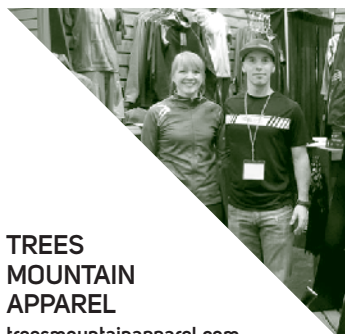
TREES MOUNTAIN APPAREL treesmountainapparel.com

Indulge in a one-of-a-kind, treetop camping getaway near Mont-Tremblant in a natural park that offers a wide array of recreational activities.