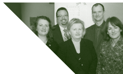
SAVOIR AFFAIRES LANAUDIÈRE-LAURENTIDES