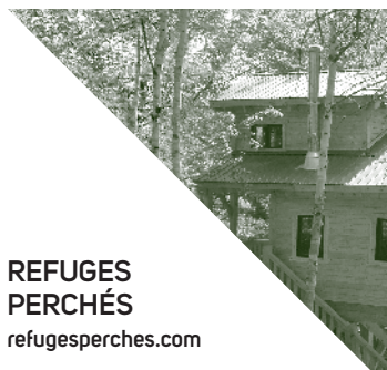
REFUGES PERCHÉS refugesperches.com

Enjoy a delicious dining experience with authentic Italian recipes on Main Street in Saint-Sauveur.