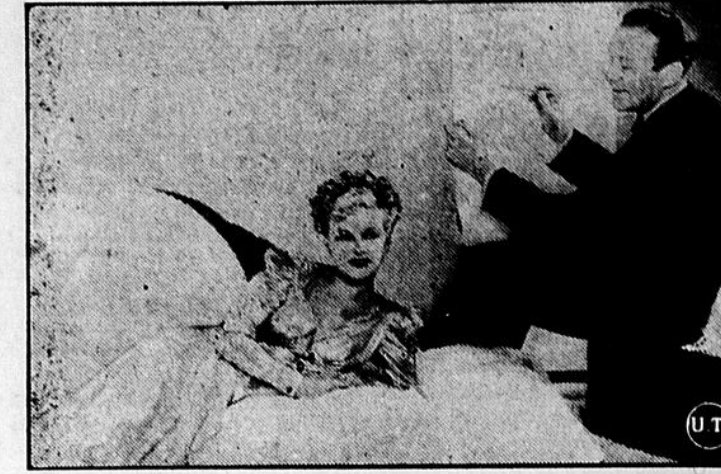
Jack Benny and Joan Bennett in a scene from the film "Artists and Models Abroad" which will open a three day engagement at the Snowdon United Theatre starting Sunday.