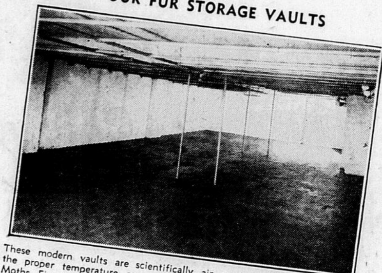
OUR FUR STORAGE VAULTS

These modern vaults are scientifically air conditioned and remain at the proper temperature constantly, giving absolute protection against Moths, Fire and Theft. They are open for your inspection at all times.