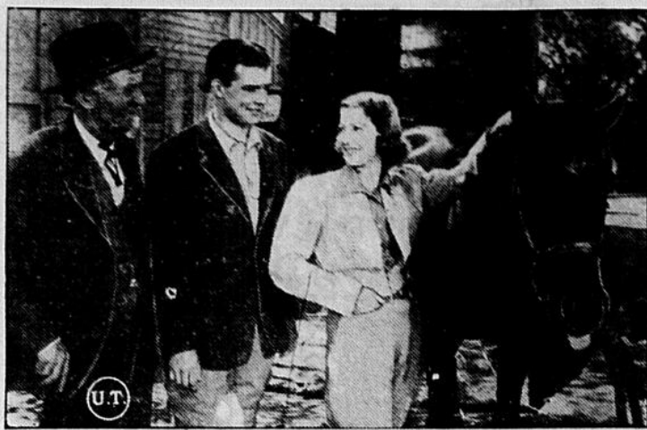
Loretta Young and Richard Greene in a scene from the film "Kentucky" which opens a three day engagement at the York United Theatre starting Saturday.