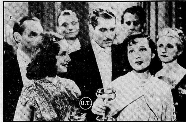
A scene from the film "Dramatic School" starring Luise Rainer, Paulette Goddard and Alan Marshal, which opens Sunday at the Westmount United Theatre.