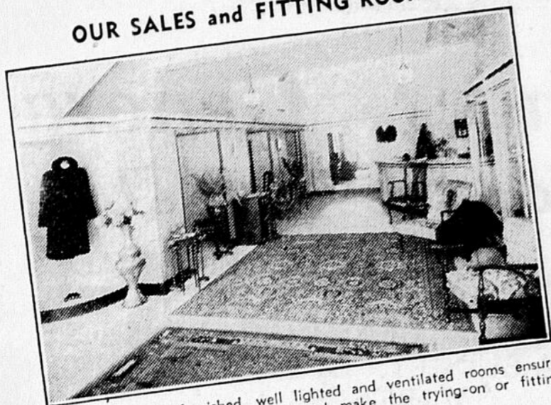
OUR SALES and FITTING ROOMS

These charmingly furnished, well lighted and ventilated rooms ensure perfect comfort and convenience, and make the trying-on or fitting of fur garments a pleasure at any season of the year.