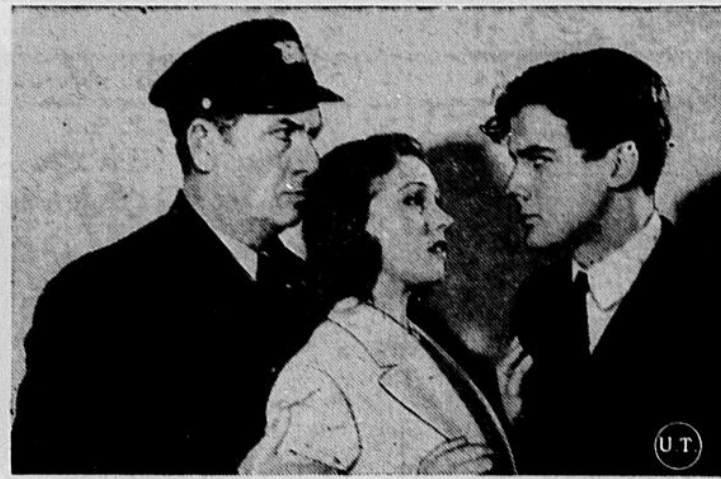
A scene from the film "Submarine Patrol" starring Richard Greene, Nancy Kelly and George Bancroft, opening Sunday at the Monkland United Theatre.