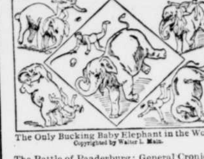
The Only Bucking Baby Elephant in the World