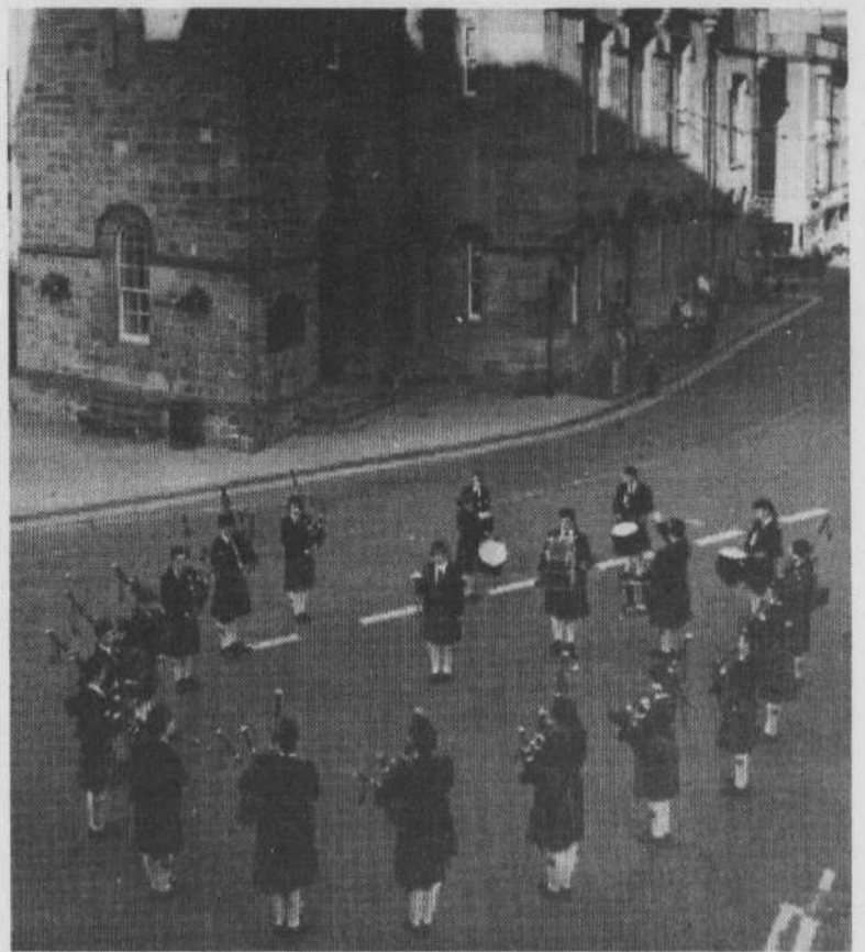
Straight from Scotland, the Sutherland Schools Pipe Band will entertain on the main stage.