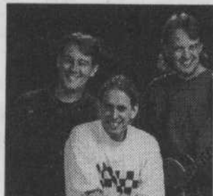
THE ARROGANT WORMS