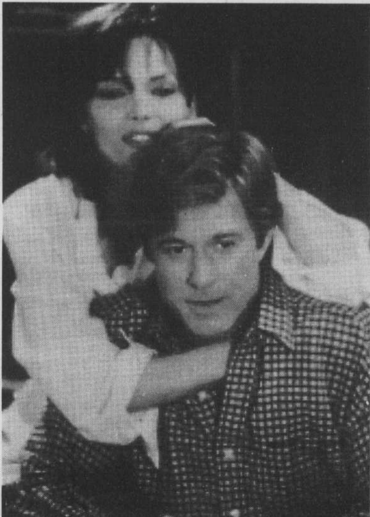
Michelle Pfeiffer and Robert Redford star in Up Close and Personal .

Pfeiffer seems to be drawn to grizzled and greying screen partners, though. Remember Jack Nicholson in Wolf ? And, like Jack, and Clint Eastwood in The Bridges of Madison County , Redford shows he can still throw off some impressive sexual sparks.