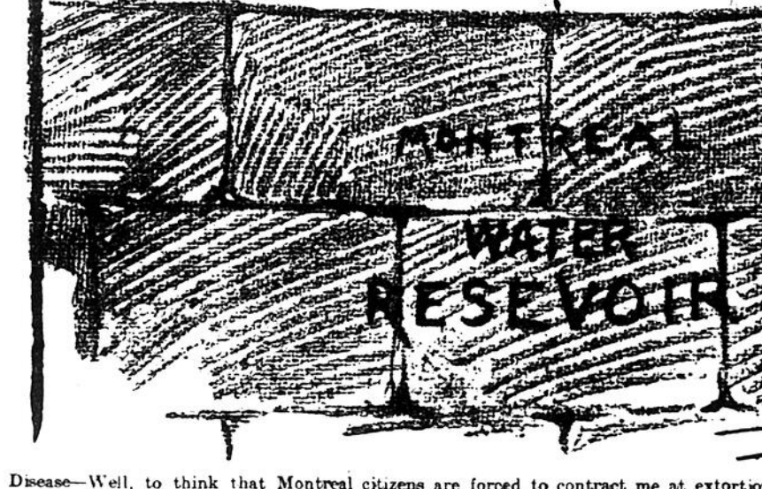
Disease—Well, to think that Montreal citizens are forced to contract me at extortionate rates, and then be disfranchised if they cannot pay, is most amusing.